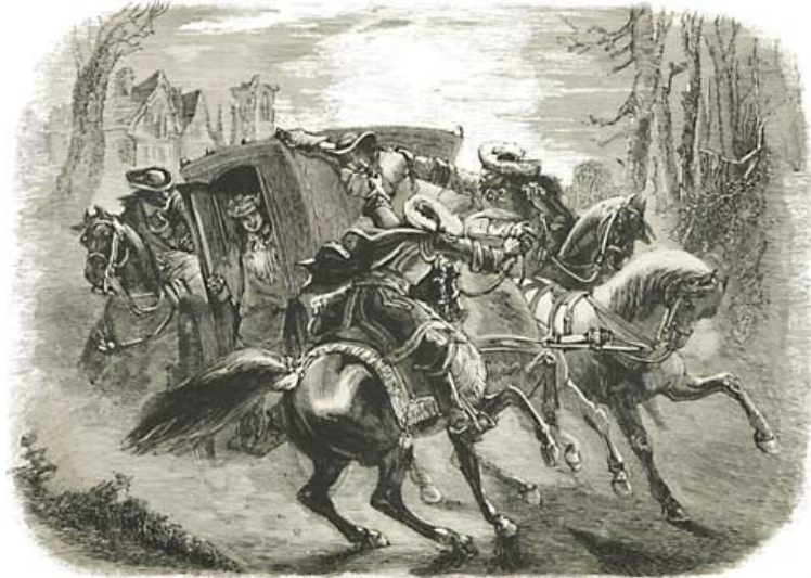
RAOUL PRESENTING HIS PISTOL THREW HIMSELF ON THE LEADER, COMMANDING THE COACHMAN TO STOP.—Page 288.

"I think it will be a very long time, Raoul, ere I return to Paris. The last sojourn we have made there has not been of a nature to encourage me to repeat it."