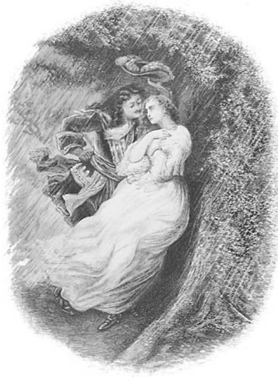
AS THE RAIN DRIPPED MORE AND MORE THROUGH THE FOLIAGE OF THE OAK, THE KING HELD HIS HAT OVER THE HEAD OF THE YOUNG GIRL.—Page 22.

"It is for your majesty to fix the day."