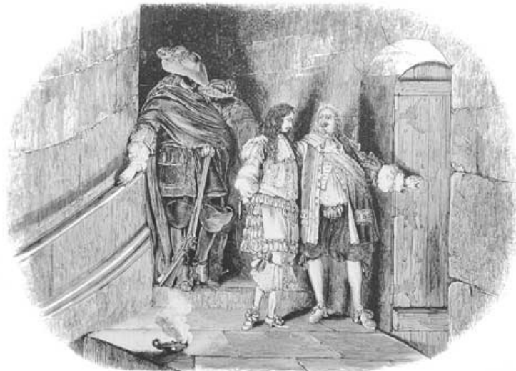
THE KING ENTERED INTO THE CELL WITHOUT PRONOUNCING A SINGLE WORD: HE WAS PALE AND HAGGARD.—Page 370.

"Well, before you retired to bed last night, you probably decided to do something this morning at the break of day."