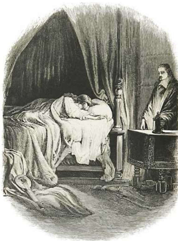
ARAMIS SAW THAT THE YOUNG MAN WAS STRETCHED UPON HIS BED, HIS FACE HALF-CONCEALED BY HIS ARMS.—Page 294.

D'Artagnan made a sign of approbation with his head.