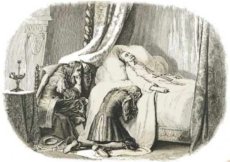
THE DEATHBED OF ATHOS—"HERE I AM!"—Page 532

"Then that will be a true preliminary of alliance, sire—I sign; but since you have done your part, tell me what shall be mine."