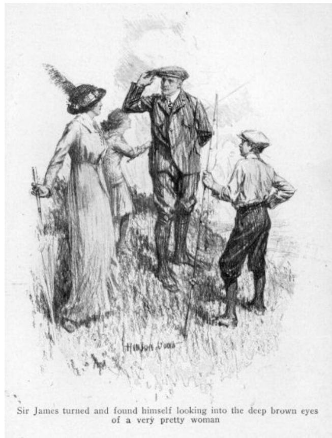
Sir James turned and found himself looking into the deep brown eyes of a very pretty woman