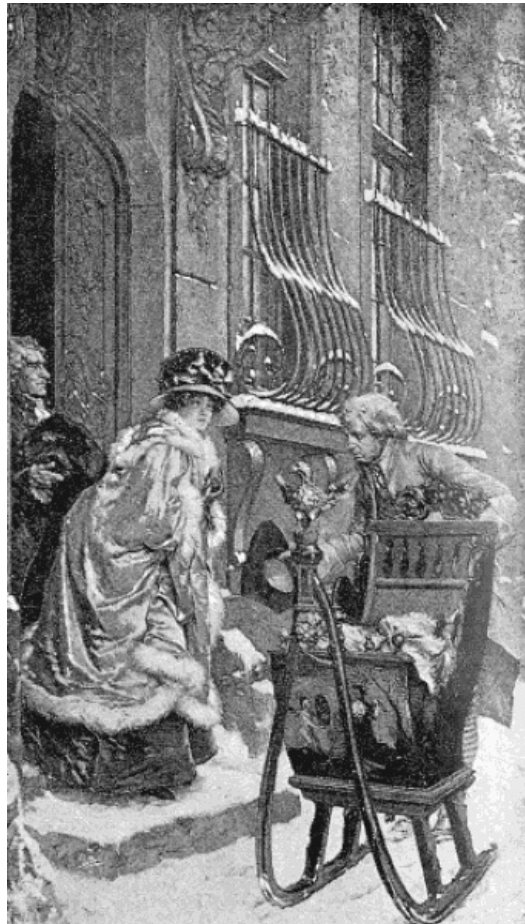
The Daughter of the Baron

Things went on from bad to worse, till, at the time of our story, between the alternate squeezings of the baron and his steward, the poor tenants had very little left to squeeze out of them. The fat pigs and pretty daughters had nearly all found their way up to the castle, and there was little left to take.