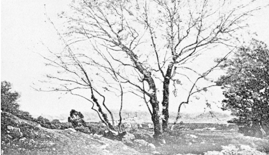
A Hilly country

In these mountains, then, in the thickest part of the woods, a certain man, of the wood-cutting trade, bethought him to build a house wherein to store the timber and live, himself and his family, when so it pleased him, and keep his beasts; and for this purpose he employed certain pillars and pieces of masonry that stood in the forest, being remains of a temple of the heathen, the which had long ceased to exist. And he cleared the wood round about, leaving only tree stumps and bushes; and close by in a ravine, between high fir-trees, ran a river, always full to the brim even in midsummer, owing to the melting snows, and of greenish waters, cold and rapid exceedingly; and around, up hill and down dale, stretched the wood of firs, larches, pines, and other noble and useful trees, emitting a very pleasant and virtuous fragrance. The man thought to enjoy his house, and came with his family, and servants, and horses, and mules, and oxen, which he had employed to carry down the timber and charcoal.