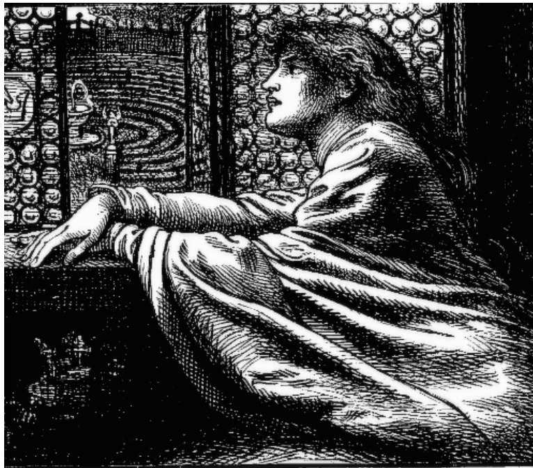
The long hours go and come and go