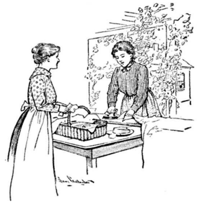
"IT HURT THE FAITHFUL OLD MAMMY'S PRIDE"