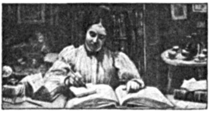
"'ASKED ME TO HUNT UP ALL THE REFERENCES'"

"'Or, suppose it were some joy that we looked forward to. When it came it would be robbed of its bloom by those long years of constant anticipation. It is the unexpected good fortune, the bits of happiness that come to us as complete surprises, which give us the keenest thrills of enjoyment.'