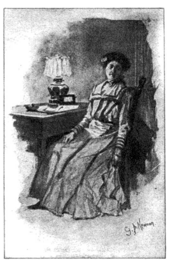
"THERE WERE VOICES PASSING HER DOOR." (See page 75)