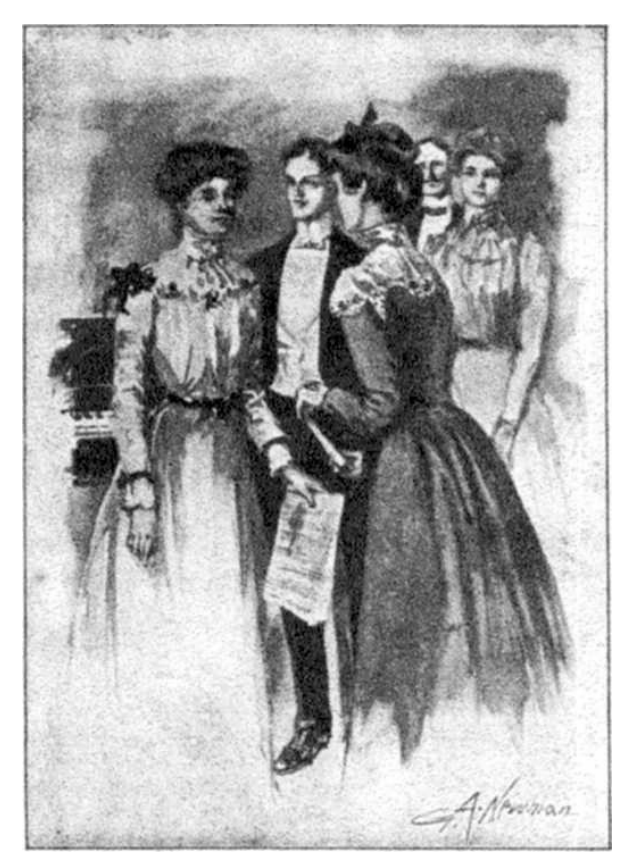
"IT WAS NOT HER VOICE ALONE WHICH DREW SO MANY ADMIRERS."