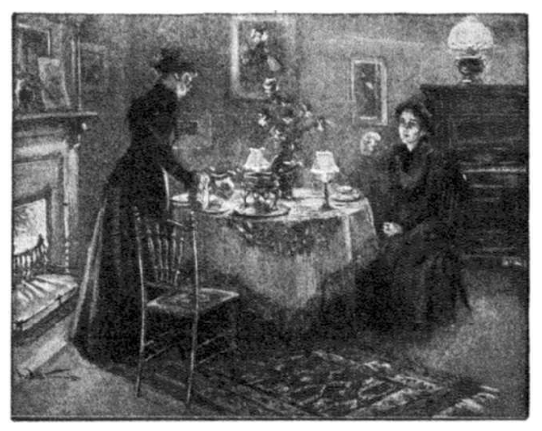
"THE CHEER AND WARMTH OF IT ALL COMFORTED HER."