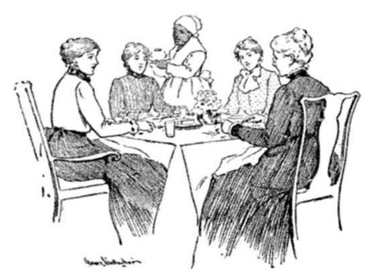
"SHE ENTERTAINED THEM WITH STORIES OF HER TRAVELS"