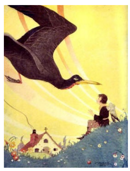
Every year, on the Bird-Boy's birthday, a great gray bird was seen.

The Queen, when she heard this terrible order, uttered a gasping scream, and seizing her little son from out his cradle, pressed him close to her breast. But although she fought for her baby with all her might, the rude strength of the jailers prevailed, and the child was torn from its mother's arms. Then, before anyone could prevent her, the poor Queen beat open the rotted fastening of an old casement window, sprang upon the ledge, and giving one last look of love and tenderness to her unhappy child, leaped down into the sea surging and pounding over the rocks hundreds of feet below. She certainly would have been dashed to pieces, had not a good spirit of the ocean taken pity on her, and changed her into a great gray bird. Crying mournfully, the bird circled the old tower thrice, and disappeared over the white-capped waters.