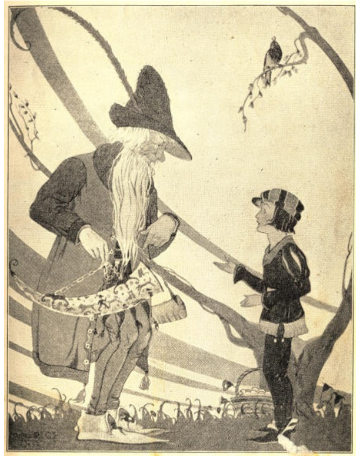
"How much does a dream cost?" asked Peter. "A golden florin," answered the Seller of Dreams

Very glad to be still alive, Peter rubbed his eyes, took up his basket of eggs, and went down the road whistling.