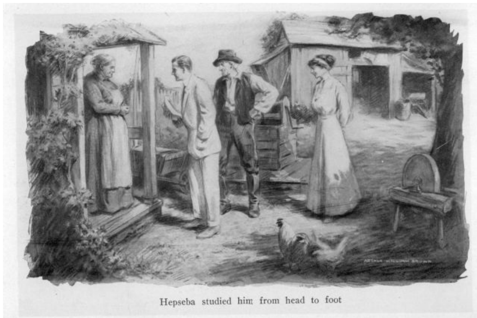
Hepseba studied him from head to foot