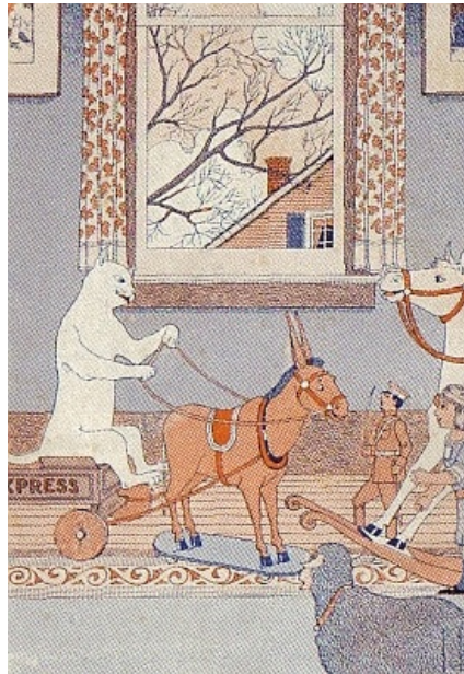
The China Cat Has a Ride in Nodding Donkey's Wagon. Frontispiece—(Page 113)