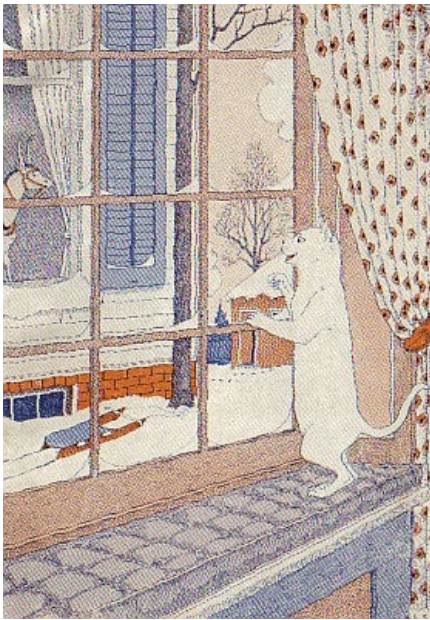
The China Cat Gazed Out of the Window.