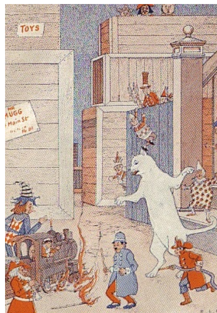
"We Must Hurry Out!" Mewed the China Cat.

But the sad part of it was that there was no water in the toy engine. They are not made that way, though sometimes boys, who get engines for presents, put water in them to play with. But though the Fireman ran out his tiny hose, and pointed it straight at the blaze, no water spurted