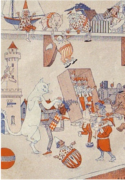
The Jumping Jack Danced With the China Cat.

"Oh, I beg your pardon! I am so sorry!" exclaimed the Jumping Jack. "I didn't mean to do that. The ball rolled, and I slipped."