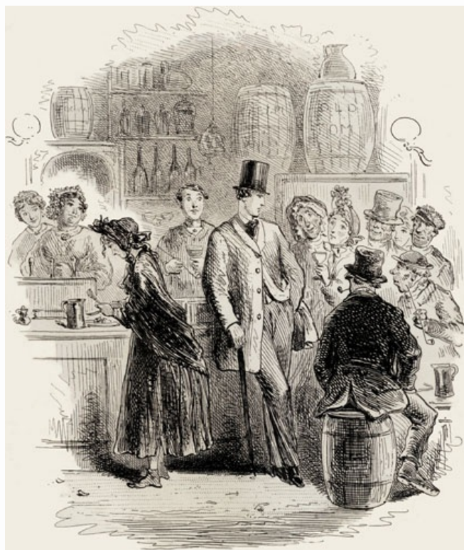
BURGO FITZGERALD. Click to ENLARGE

Poor Burgo! All who had seen him since life had begun with him had loved him and striven to cherish him. And with it all, to what a state had he come! Poor Burgo! had his eyes been less brightly blue, and his face less godlike in form, it may be that things would have gone better with him. A sweeter-tempered man than he never lived,—nor one who was of a kinder nature. At this moment he had barely money about him to take him down to his aunt's house at Monkshade, and as he had promised to be there before Christmas Day, he was bound to start on the next morning, before help from Mr. Magruin was possible. Nevertheless, out of his very narrow funds he had given half a crown to comfort the poor