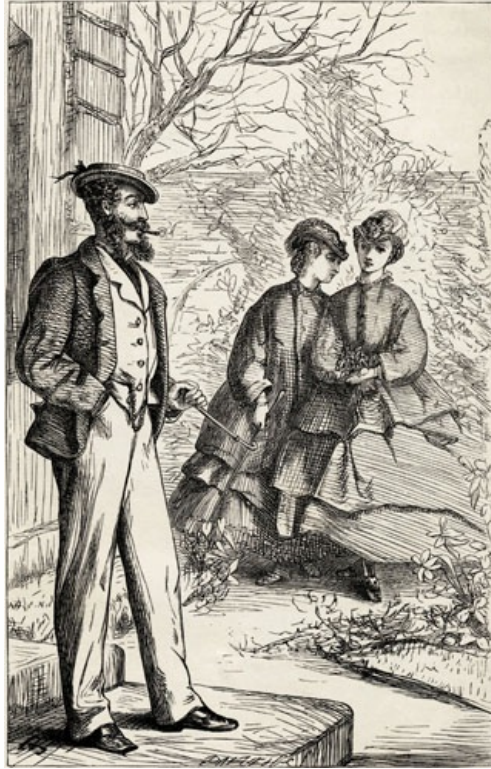
A SNIFF OF THE ROCKS AND VALLEYS.

Greenow,"—here the handkerchief was again used—"Thanks to dear Greenow, I shall never want. Of course I shan't let any of the money go into his hands,—the Captain's, I mean. I know a trick worth two of that, my dear. But, lord love you! I've enough for him and me. What's the good of a woman's wanting to keep it all to herself?"