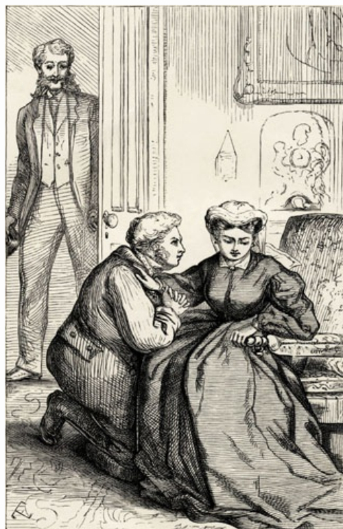
MR. CHEESACRE DISTURBED.

"Bid you play the fiddle. Get away from my knees, at any rate. There;—he'll be in the room now before—"