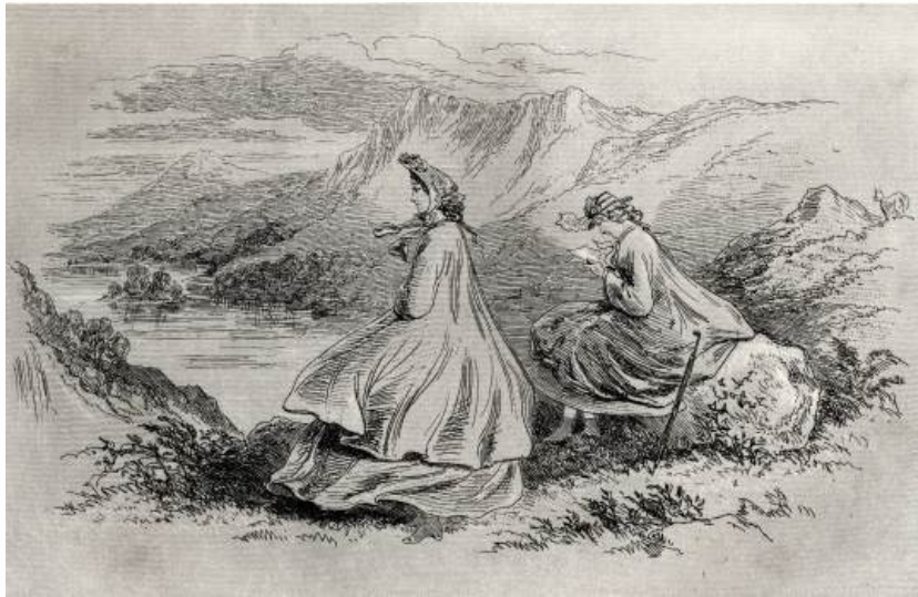
SWINDALE FELL. Click to ENLARGE

"No," said Alice; "it is not from Mr. Grey." And she gave her companion the paper. Kate before she had touched it had seen that it was from her brother George; and as she opened it looked anxiously into Alice's face. "Has he offended you?" Kate asked.