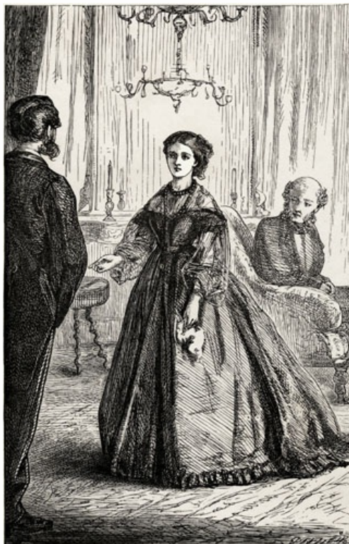
SHE MANAGED TO CARRY HERSELF WITH SOME DIGNITY.

As Mr. Grey entered the room Alice knew that she was flurried, but still she managed to carry herself with some dignity. His bearing was perfect. But then, as she declared to herself afterwards, no possible position in life would put him beside himself. He came up to her with his usual quiet smile,—a smile that was genial even in its quietness, and took her hand. He took it fairly and fully into his; but there was no squeezing, no special pressure, no love-making. And when he spoke to her he called her Alice, as though his doing so was of all things the most simply a matter of course. There was no tell-tale hesitation in his voice. When did he ever hesitate at anything? "I hear you are going abroad," he said, "with your cousin, Lady Glencora Palliser."