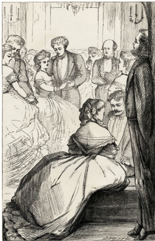
Mr. BOTT ON THE WATCH. Click to ENLARGE

In the meantime Lady Glencora went off towards the dancers, leaning on Burgo's arm. "Who is that woman?" said Burgo. They were the first words he spoke to her, though since he had last seen her he had written to her that letter which even now she carried about her. His voice in her ears sounded as it used to sound when their intimacy had been close, and questions such as that he had asked were common between them. And her answer was of the same nature. "Oh, such an odious woman!" she said. "Her name is Mrs. Marsham; she is my bête noire ." And then they were actually dancing, whirling round the room together, before a word had been said of that which was Burgo's settled purpose, and which at some moments was her settled purpose also.