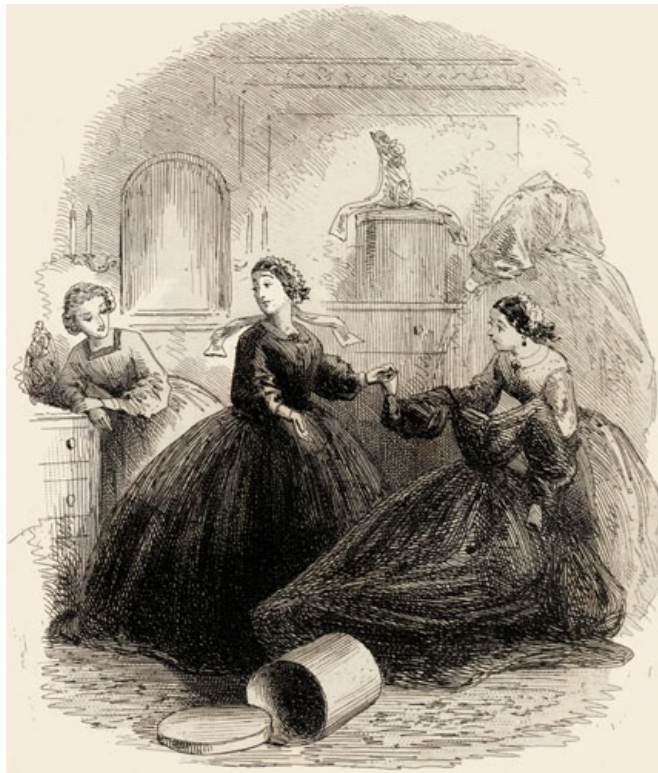
"PEACE BE TO HIS MANES." Click to ENLARGE

"He is left her uncommon well off, I suppose," said Mrs. Jones to Jeannette.