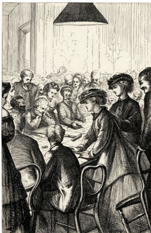
LADY GLENCORA AT BADEN.

"I think she is very happy. I never get money given to me by handfuls, and the man to whom I belong gives me no encouragement when I want to amuse myself." They were now standing near to one end of the table, and suddenly there came to be an opening through the crowd up to the table itself. Lady Glencora, leaving Alice's side, at once stepped up and deposited a piece of gold on one of the marked compartments. As soon as she placed it she retreated again with flushed face, and took hold of Alice's arm. "There," she said, "I have done it." Alice, in her dismay, did not know what step to take. She could not scold her friend now, as the eyes of many were turned upon them, nor could she, of course, leave her, as she had threatened. Lady Glencora laughed with her peculiar little low laughter, and stood her ground. "I was determined you shouldn't frighten me out of it," she said.