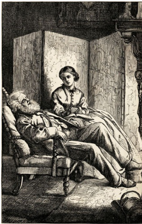
THE LAST OF THE OLD SQUIRE. Click to ENLARGE

After that Kate went to her own room and wrote her letters. The first she wrote was to her aunt Greenow. That was easily enough written. To Mrs. Greenow it was not necessary that she should say anything about money. She simply stated her belief that her grandfather's last day was near at hand, and begged her aunt to come and pay a last visit to the old man. "It will be a great comfort to me in my distress," she said; "and it will be a satisfaction to you to have seen your father again." She knew that her aunt would come, and that task was soon done.