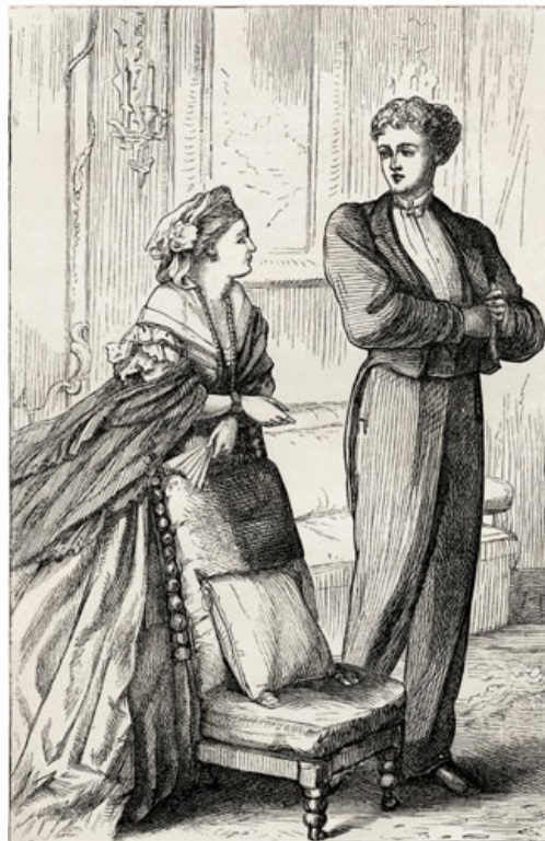
"ALL RIGHT," SAID BURGO, AS HE THRUST THE MONEY INTO HIS BREAST-POCKET.