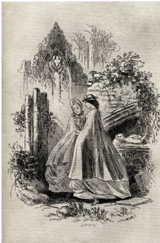
THE PRIORY RUINS. Click to ENLARGE

"Is it not beautiful!" said Glencora. "I do love it so! And there is a peculiar feeling of cold about the chill of the moon, different from any other cold. It makes you wrap yourself up tight, but it does not make your teeth chatter; and it seems to go into your senses rather than into your bones. But I suppose that's nonsense," she added, after a pause.