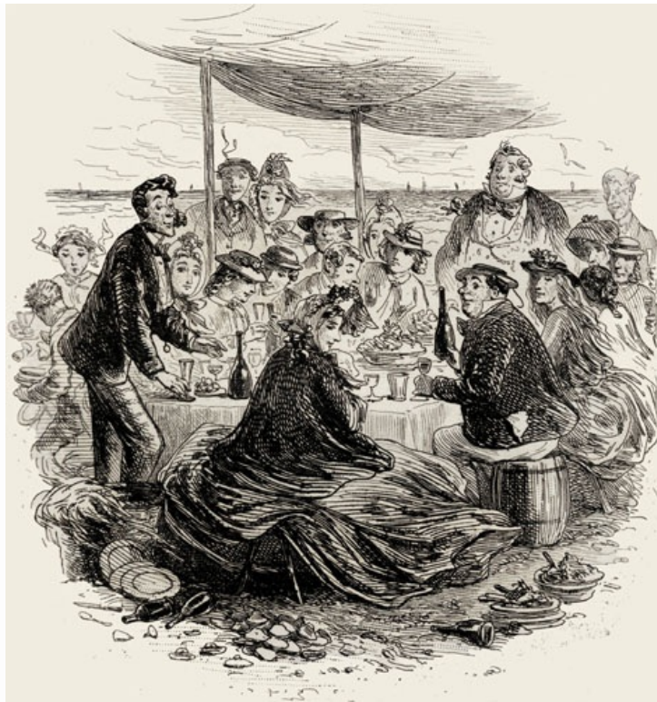
CAPTAIN BELLFIELD PROPOSES A TOAST. Click to ENLARGE

"If you please, Captain Bellfield," said the patron, indifferent to the cheese in his throat, "I'll propose the toast."