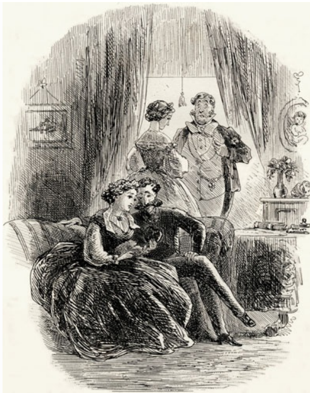
"DEAR GREENOW; DEAR HUSBAND!" Click to ENLARGE

Bellfield, moved by the eloquence of her words, looked with some interest at the photograph. There was represented there before him, a small, grey-looking, insignificant old man, with pig's eyes and a toothless mouth,—one who should never have been compelled to submit himself to the cruelty of the sun's portraiture! Another widow, even if she had kept in her book the photograph of such a husband, would have scrambled it over silently,—would have been ashamed to show it. "Have you ever seen it, Mr. Cheesacre?" asked Mrs. Greenow. "It's so like him."