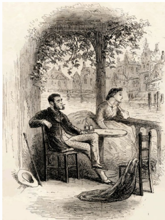
THE BALCONY AT BASLE.