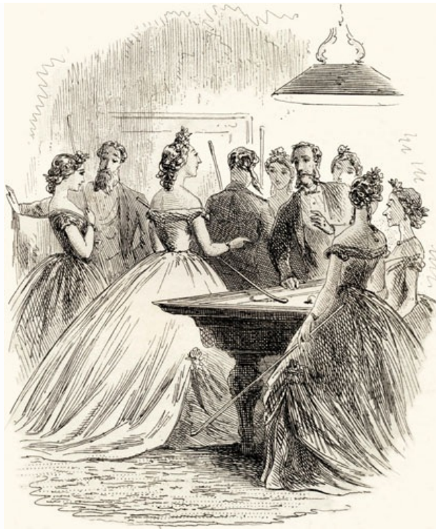
"MR. PALLISER, THAT WAS A CANNON." Click to ENLARGE

"Oh no, Duchess, you hit the same ball twice."