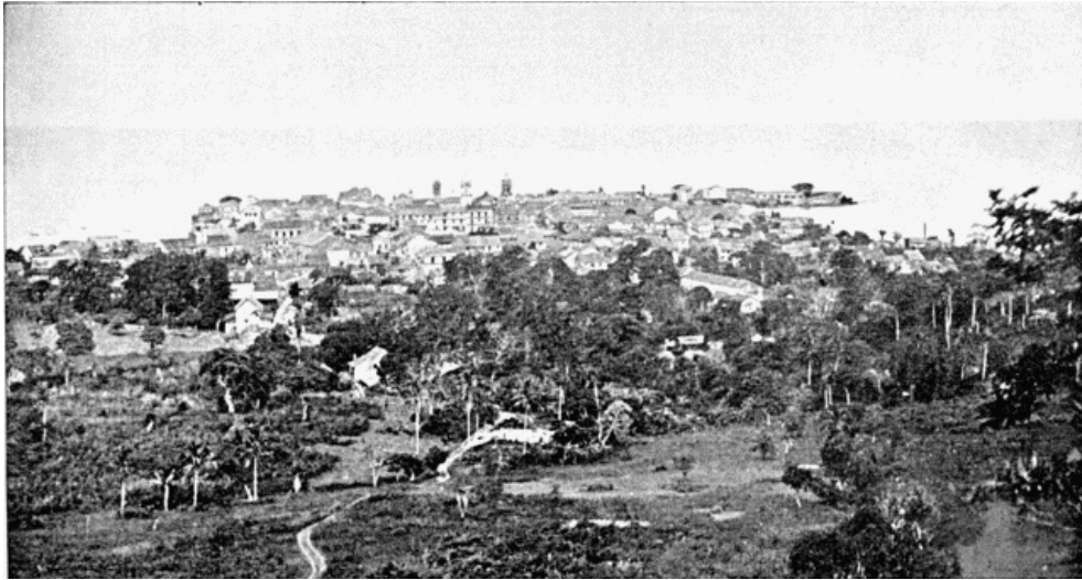
THE CITY OF PANAMA.

[pg 152] under so famous a leader as Morgan, and looking for rich spoil under a man whose rule of conduct was, "Where the Spaniards obstinately defend themselves there is something to take, and their best fortified places are those which contain the most treasure."