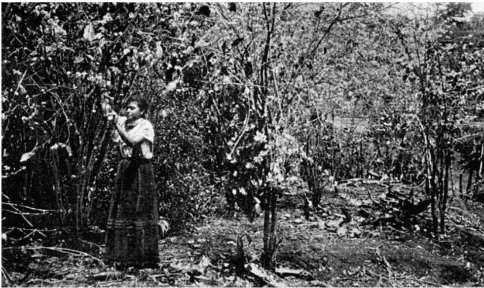
COFFEE PLANT IN BLOSSOM.