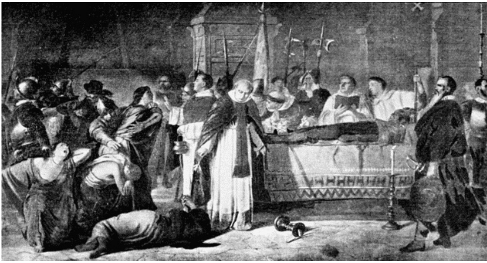
DEATH OF ATAHUALPA, FROM A PAINTING IN THE CATHEDRAL AT CALLAO.

Hernando Pizarro, who had shown himself a strong friend of the captive, was absent. De Soto, another of his friends, was sent at the head of an expedition to Huamachuco, a town a hundred miles away, where it was said the natives were in arms. Scarcely had he gone when Pizarro, seeming to yield to the demands of the soldiers, decided to bring Atahualpa to trial on the charges against him.