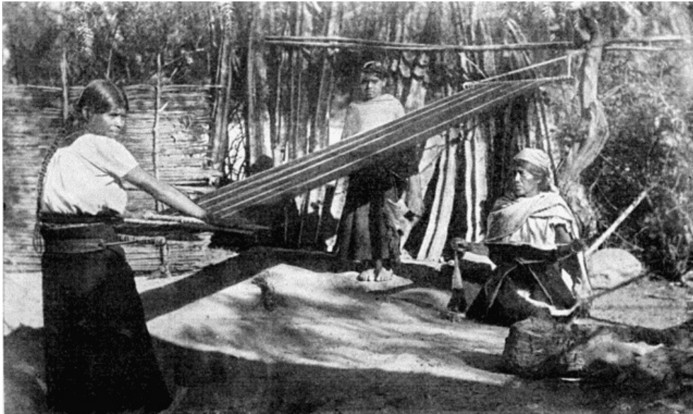
INDIAN SPINNING AND WEAVING.

Of his books, the one he most frequently consulted was a French dictionary of the arts and industries. From this he gained the idea of founding public workshops, in which the workmen were stimulated to activity alike by threats and money. At one time he condemned a blacksmith to hard labor for awkwardness. At another, when he had erected a gallows, he proposed to try it on a shoemaker if he did not do his work properly, while promising to richly reward him if he did.