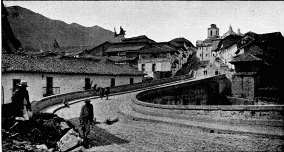
BRIDGE ENTERING QUITO.