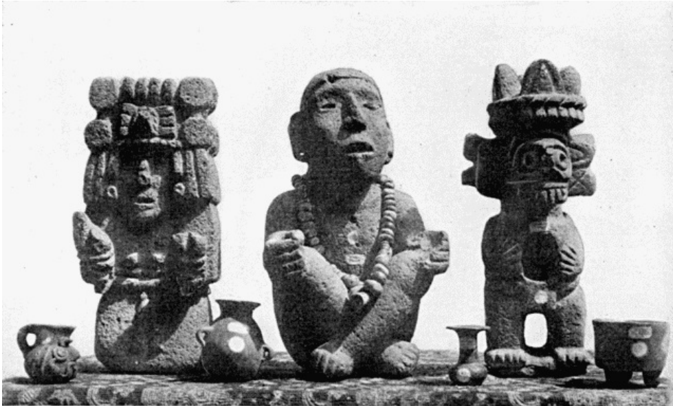
AZTEC IDOLS CARVED IN STONE.

gone, their bright arms soiled, and only a miserable and shattered fragment of their proud force was left, these dragging themselves along with pain and difficulty.