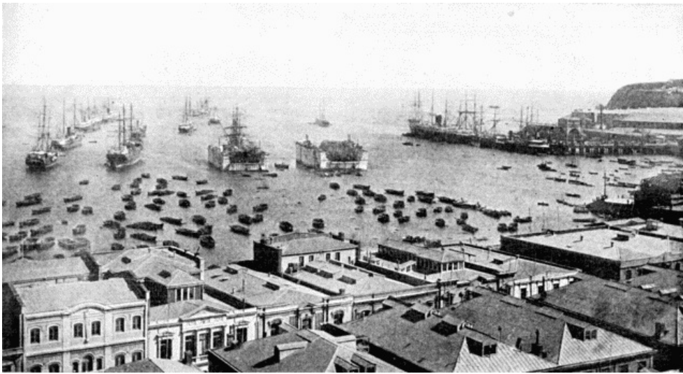
THE HARBOR OF VALPARAISO.

[pg 128] Onward they sailed, nearing the scene of the famous adventures of Pizarro, and about the 1st of December entered a harbor on the coast of Chili. Before them, at no great distance, lay sloping hills on which sheep and cattle were grazing and corn and potatoes growing. They landed to meet the natives, who came to the shore and seemed delighted with the presents which were given them. But soon afterwards Drake and a boatload of his men, who had gone on shore to procure fresh water, were fiercely attacked by ambushed Indians, and every man on board was wounded before they could pull away. Even some of their oars were snatched from them by the Indians, and Drake was wounded by an arrow in the cheek and struck by a stone on the side of his face.