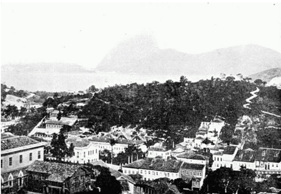
RIO JANEIRO AND HARBOR.