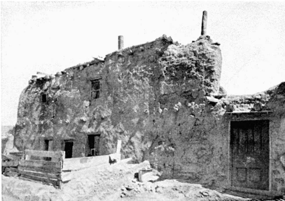
OLDEST HOUSE IN THE UNITED STATES, SANTA FE.

Santa Fé at that time contained about six thousand inhabitants. After St. Augustine it was the oldest city within the limits of the United States. When the Spaniards founded it in 1582, it was built on the site of one of the old Indian pueblos, whose date went back to the earliest history of the country. The Spanish town—The Royal City of the Holy Faith, La Villa Real del Santa Fé , as they called it—was also full of the flavor of antiquity, with its low adobe houses, and its quaint old churches, built nearly three centuries before. These were of rude architecture and hung with battered old bells, but they were ornamented with curiously carved beams of cedar and oak. The residences were as quaint and old-fashioned as the churches, and the abundant relics of the more ancient Indian inhabitants gave the charm of a double antiquity to the place.