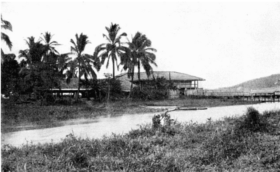
A TROPICAL BUNGALOW AND PALMS.

Governor Berreo tried to treat Raleigh as he had done his agent, forbidding any of the Indians to go on his ships on peril of death. But they went on board, for all that, and were delighted with the kind treatment they received. They told Raleigh that several of their chiefs had been seized and imprisoned in the town of St. Joseph, and begged him to rescue them. No Englishman of that day hesitated when the chance came to deal the Spaniards a blow, and a vigorous attack was soon made on the town, it being captured, the chiefs set free, and the governor himself made a prisoner.