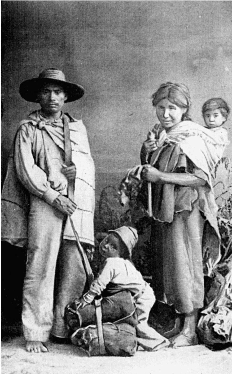
INDIANS OF THE PLATEAU.

the dealings with the Indians, but the settlers, thousands of miles away, paid no attention to these laws, and the red men were almost everywhere reduced to slavery, or where free and given political rights, were looked upon as far inferior to the whites. In every district Spain placed an official called the "Protector of the Indians," but it does not appear that they were much the better off for their "Protectors." It is our purpose here to say something about the cruel treatment of the natives in South America.