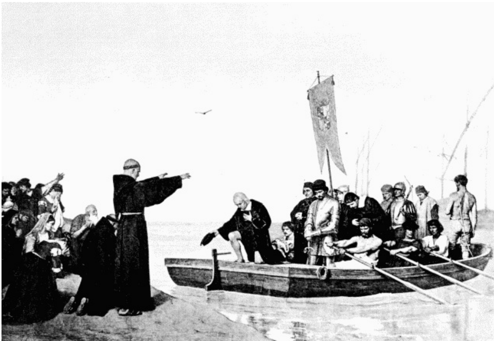
DEPARTURE OF COLUMBUS.