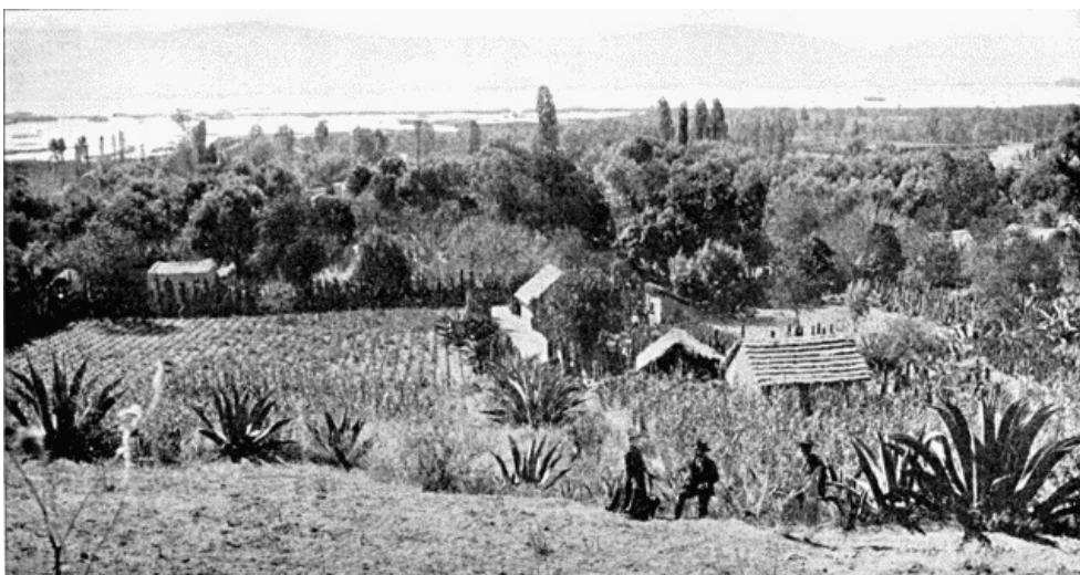
ON THE BORDER OF LAKE CHALCO.

The principal lakes visible were Lake Chalco, with the long, narrow lake of Xochimilco near it, and seven miles to the north Lake Tezcuco, near the western shore of which the city of Mexico was visible. Between Chalco and Tezcuco ran the national road, for much of its length a narrow causeway between borders of marsh-land. Near Lake Xochimilco was visible the Acapulco road. Strong works of defence commanded both these highways.