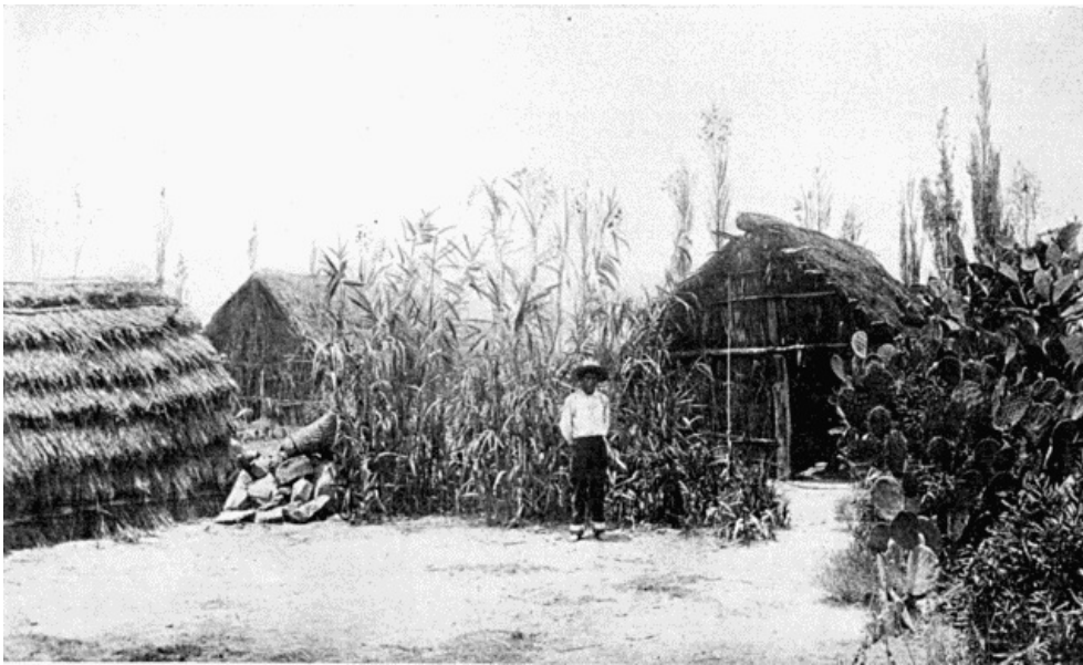
SOUTH AMERICAN NATIVE HUT.