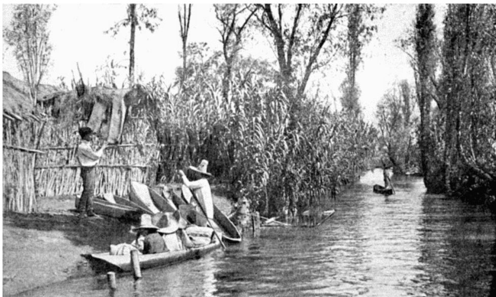
FLOATING GARDENS ON THE CHENAMPAS.

About a hundred years before the Spanish conquest of the Aztecs, there reigned over the kingdom of Tezcucó, in the valley of Mexico, a monarch whose history is as interesting and romantic as any that can be found in the annals of Europe. His story was preserved by his descendants, and its principal events are as follows: