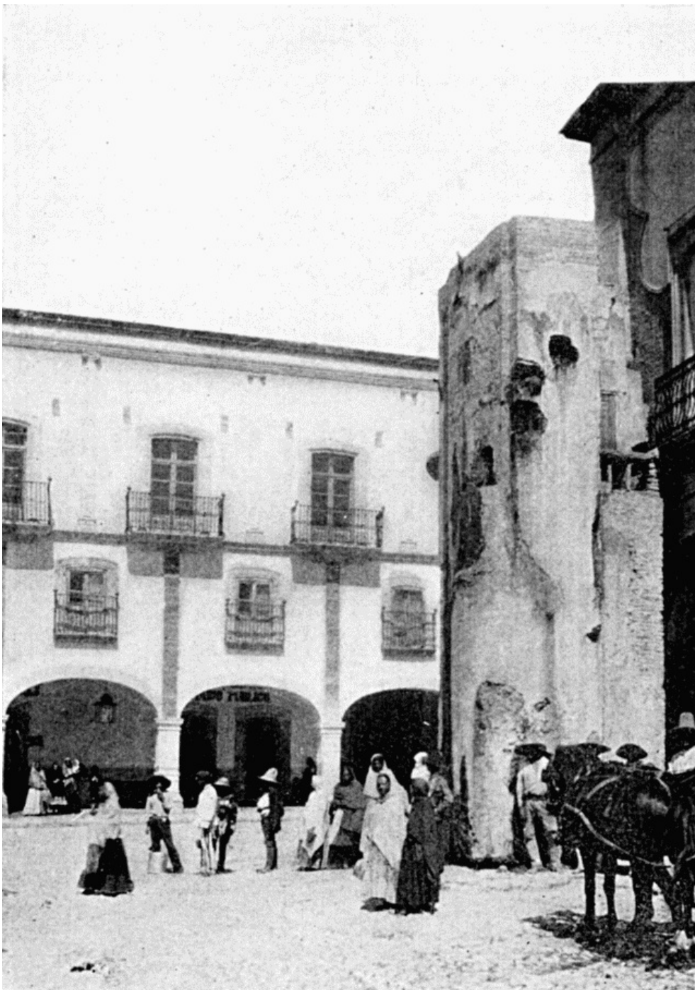
HOUSE OF MAXIMILIAN AT QUERETARO.

When Napoleon III. found himself master of Mexico, he looked around for a man who would serve him as a tool to hold the country. Such a man he found in Ferdinand Joseph Maximilian, the brother of the emperor of Austria, a dreamer rather than a man of action, and a fervent believer in the "divine right of kings." This was the kind of man that the French usurper was in want of, and he offered him the position of emperor of Mexico. Maximilian was taken by surprise. The proposition was a startling one. But in the end ambition overcame judgment, and he accepted the lofty but perilous position on the condition that France should sustain him on the throne.