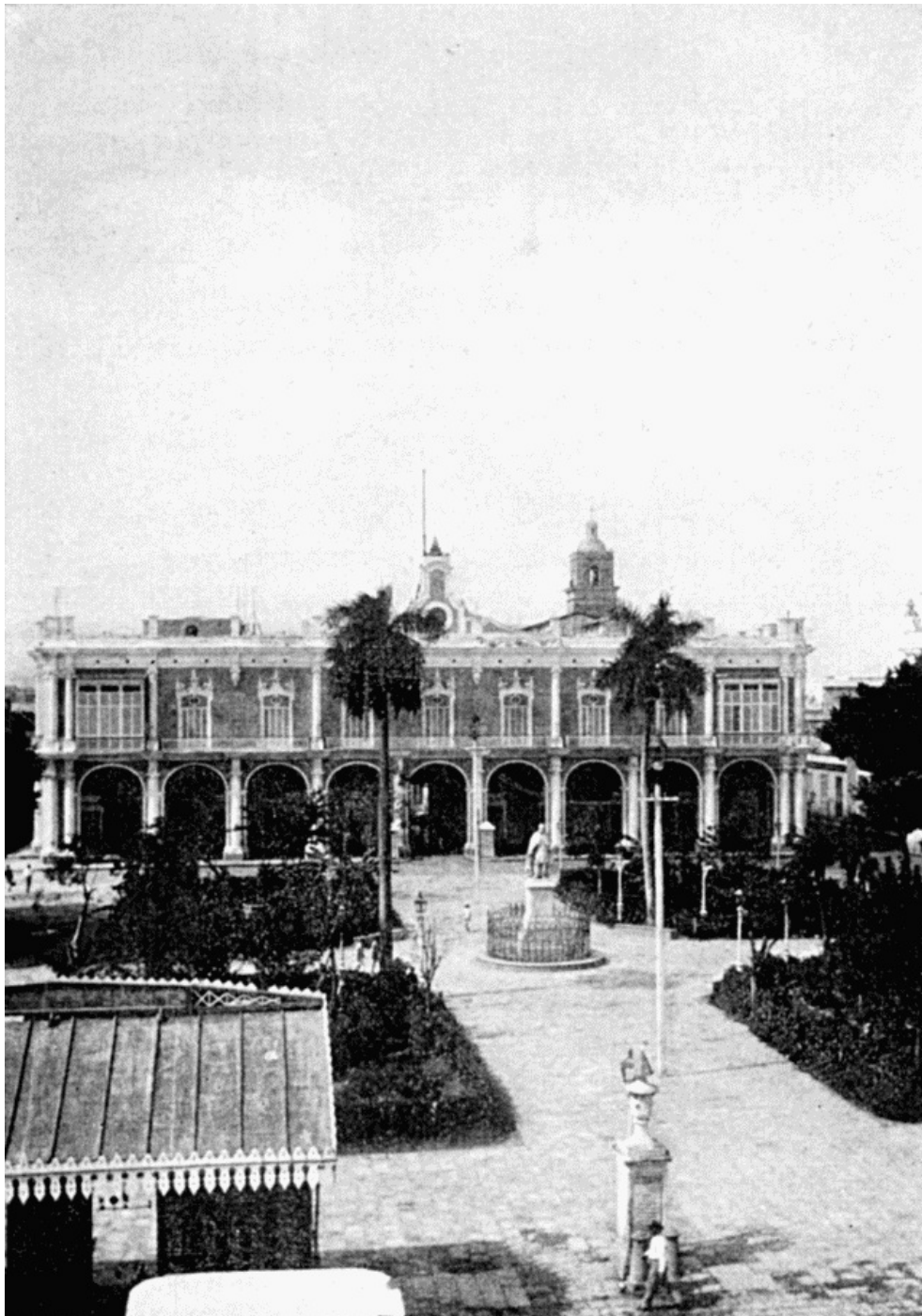
THE GOVERNOR-GENERAL'S PALACE, HAVANA.

It was a delicate movement to slip between the soldiers during the short interval when their eyes were turned from the entrance, but the stranger at length adroitly effected it, darting lightly and silently across the short space and hiding himself behind one of the pillars of the palace before they turned again. During their next turn he entered the palace, now safe from their espionage, and sought the broad flight of stairs which led to the governor's rooms with the confidence of one thoroughly familiar with the place.