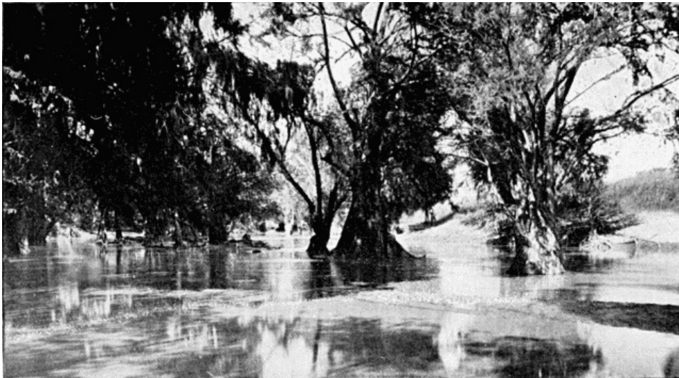
A TROPICAL RIVER SCENE.

[pg 010] On went the Spanish caravels, sailing over bright and placid waters scarce ruffled by the gentle breeze, and touching at isle after isle, each of which seemed to the voyagers more beautiful than the last. Besting under the shade of warm and verdant groves, while his men sought to fill their water-casks from the purest and coolest springs, the admiral found the scene around him entrancing to his vision, "the country as fresh and green as the month of May in Andalusia; the trees, the fruits, the herbs, the flowers, the very stones, for the most part, as different from those of Spain as night from day."