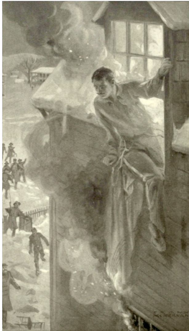
"TELL HIM THAT I'D LIKE AN EXTENSION OF ARREST."

"Give my compliments to the colonel, will you, and tell him that, my quarters being all ablaze, I'd like an extension of arrest?"