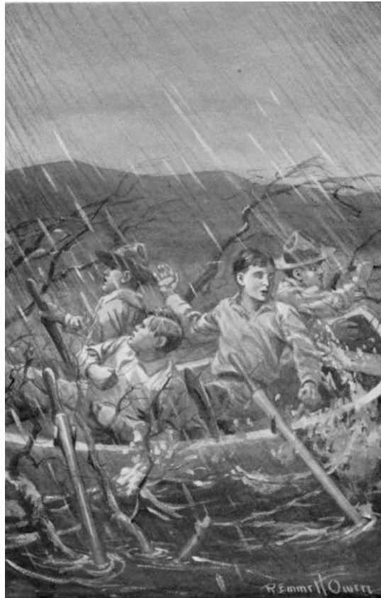
THE TREE POKED ITS BRANCHES UP OUT OF THE BLACK WATER AND GUIDED THEM TO SAFETY.

too, perched on the edge of the hollow, must have been swept away.