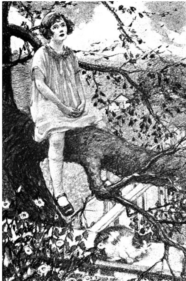
"BE YE REMOVED INTO THE MIDST OF THE SEA"

Marian did not gaze at this, however, but turned her face toward the mountains. She clasped her hands tightly and repeated firmly: "Be ye removed into the midst of the sea. Be ye removed into the midst of the sea." Then she waited, but the mountain did not budge an inch, though the child kept her eyes fixed upon it. Twice, three times, she repeated the words, but the mountain remained immovable. "I knew it; I just knew it," exclaimed the child when she had made her final effort, "and now I want to know how large a mustard seed is. To-morrow I'll go ask Mrs. Hunt."