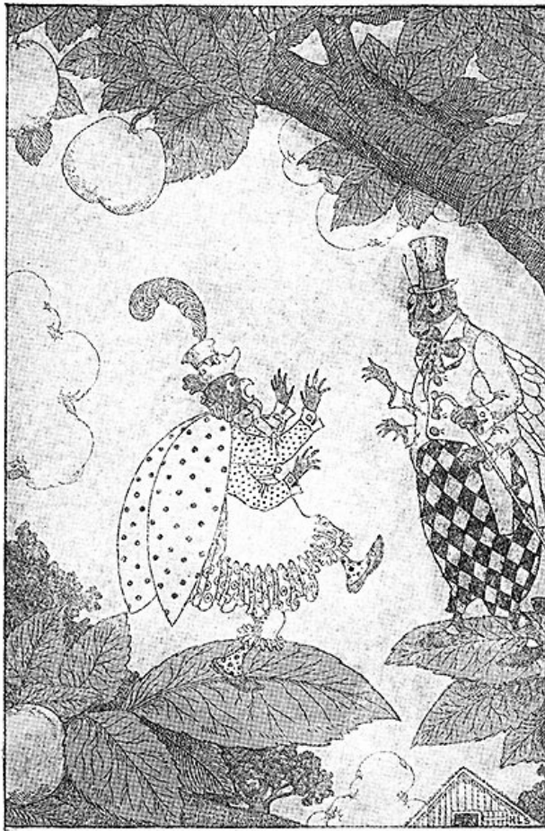
Mrs. Ladybug Scolds Buster Bumblebee. Frontispiece—(Page 12)