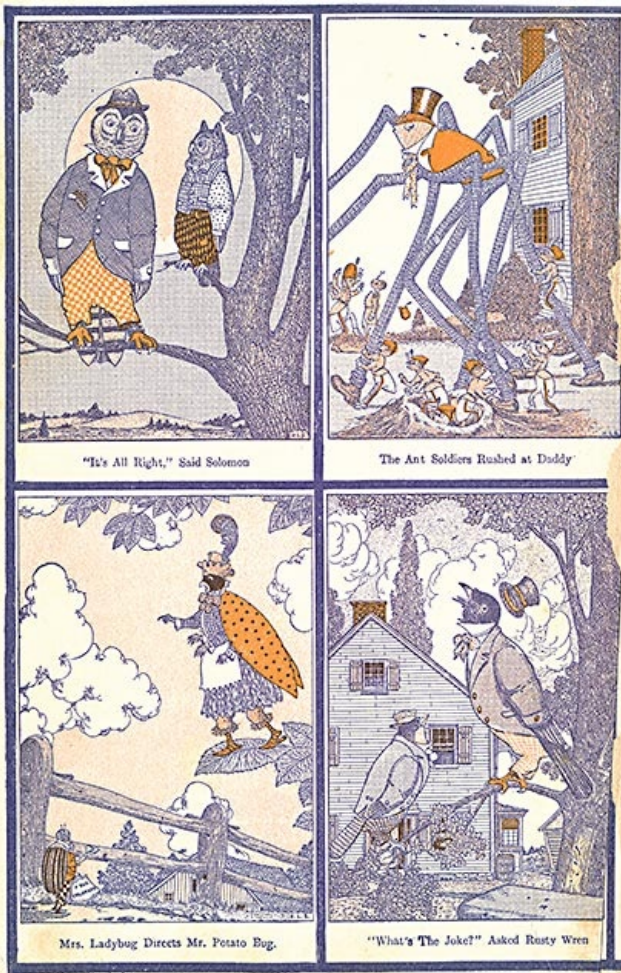
Left front endpaper