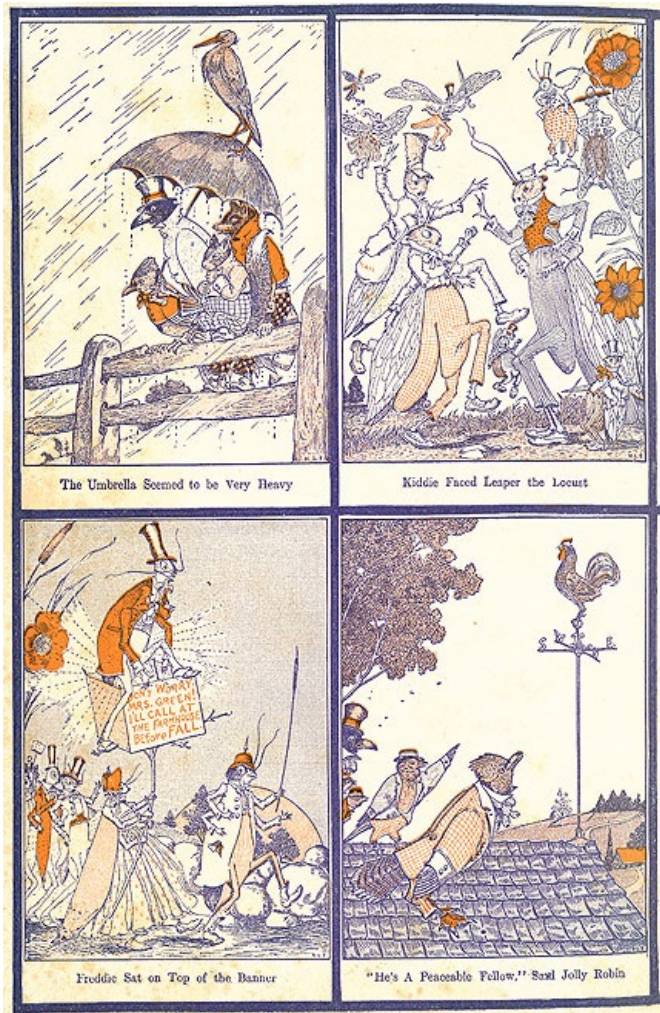
The Umbrella Seemed to be Very Heavy