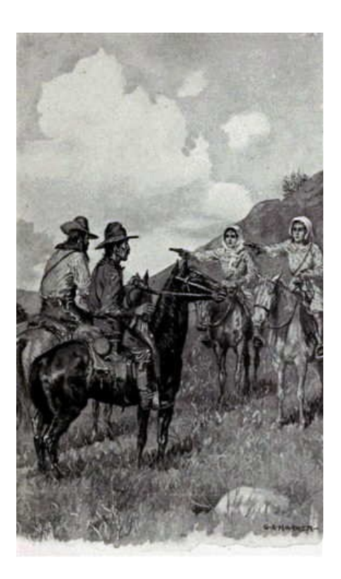
"YOU CAN TURN YOUR HORSES AROUND AND RIDE BACK THE WAY YOU CAME."

"And you, too, stay right where you are," and Ruth's pistol suddenly turned the big man with a broken nose into a wildly staring equestrian statue. "We two girls are not going to take any chances with you two men; and—and now that we have given you all the information that we have for you, you can turn your horses around and ride back the way you came."