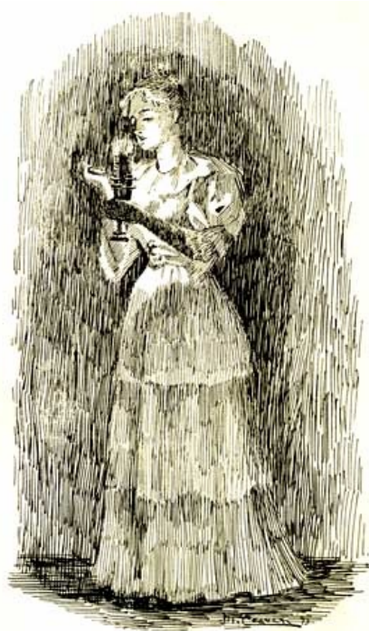
And Opened the Case of A Miniature, Slowly and With Deliberate Care.

The little fellow made a bow quite worthy of the days of minuet and hoop, and then, running back, kissed the tall mother with a certain passionate tenderness, saying, softly, "Now, don't you cry when we are gone, dear, dear mamma," and then, in a whisper, "I will pway God not to let you cw," and so fled away, leaving her still perilously close to tears. Very soon, up-stairs, the old nurse, troubled by the children's disappointment, was assuring them with eager mendacity that Kris would be certain to make his usual visit, while down-stairs the mother walked slowly to and fro. She had that miserable gift, an unfailing memory of anniversaries, and now, despite herself, the long years rolled back upon her, so that under the sad power of their recurrent memories she seemed a helpless prey. [16]