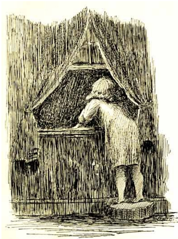
"Mr. Khwis Kwingle, Are You There? Or Is You A Wobber?"

"I will look—I must look," cried Hugh, slipping from his bed. In a moment he had raised the sash and was looking out into the night. The sounds he had heard ceased. He could see no one. "He has gone, Alice." Then he cried, "Mr. Khwis Kwingle, are you there? or is you a wobber?" As he spoke a cloaked man came from behind a great pine and stood amid the thickly-fallen flakes. [23]