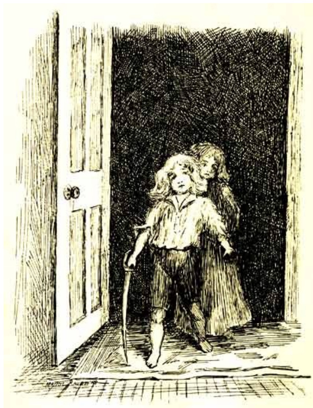
He Made A Pretty Picture—Alert and Quite Fearless.

"My sister thinks perhaps you are a wobber, sir; but I think you are Mr. Khwis Kwingle."