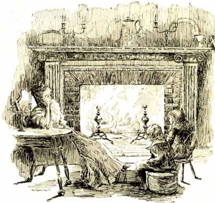
A Silent Group About the Hearth.