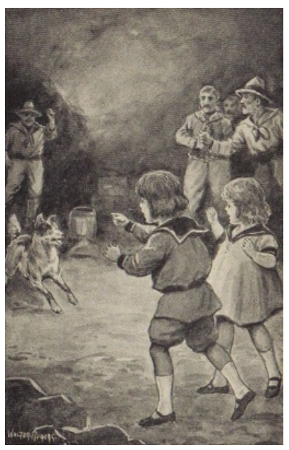
"OH, FLOSSIE! HERE COMES SNAP!"

The Bobbsey Twins on Blueberry Island. Page 230