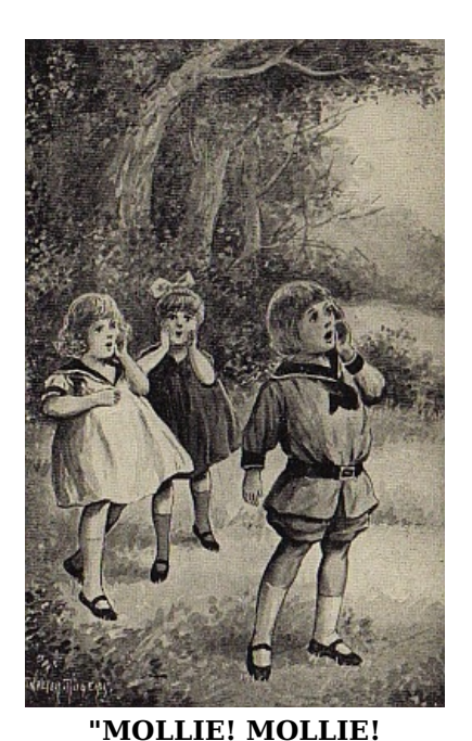
WHERE ARE YOU?" The Bobbsey Twins on Blueberry Island.