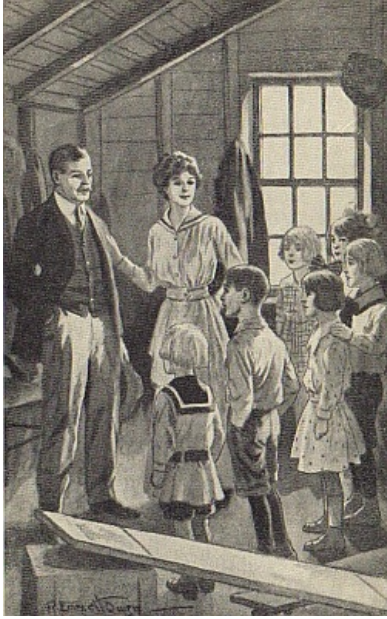
THE SIX LITTLE BUNKERS STOOD IN A HALF CIRCLE AND LOOKED UP AT THE STRANGE MAN.

The six little Bunkers, who had been untangled from the mix-up caused when the scooter ran sideways off the ironing-board hill, stood in a half circle and looked at the strange man. He did not seem quite so strange now, and he certainly smiled in a way the children liked.