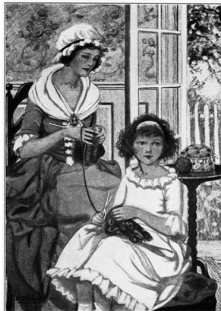
HOW LONG THE AFTERNOON SEEMED!

"Why, child! You have been so quiet I had forgotten you. Run out to the sitting-room to Mrs. Lyon," and Anna obeyed, not forgetting to curtsy as she left the room.