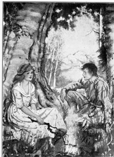
SHE ADDED WOOD TO THE FIRE