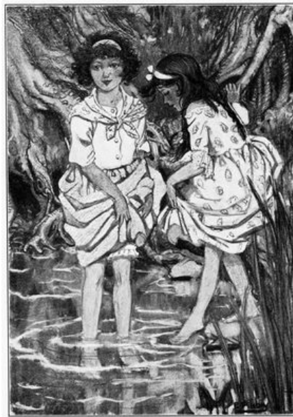
"WE'LL WADE OUT TO FLAT ROCK"

The stains did not seem to come out of the stockings; they looked gray and streaked, so Luretta dipped them again, paying little attention to her companions.