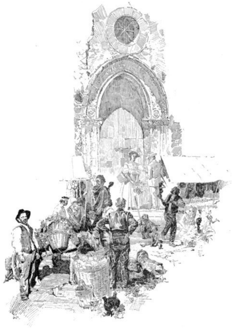
“The two mounted the steps of the jail and jerked the bell”