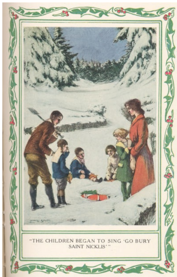
"THE CHILDREN BEGAN TO SING 'GO BURY SAINT NICKLIS'"

"I just want it," she said; "I've—took a notion."