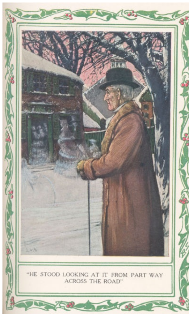
"HE STOOD LOOKING AT IT FROM PART WAY ACROSS THE ROAD"

Now with all these bewilderments she was to have to do. She wondered if she would know how to dress him. Once she had watched Mis' Winslow dress a child, and she remembered what unexpected places Mis' Winslow had buttoned—buttonholes that went up and down in the skirt bands, and so on. Armholes might be too small and garters too tight, and how was one ever to know? If it were a little girl now ... but a little boy.... What would she talk to him about while they ate together?