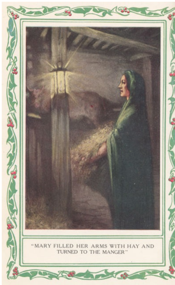
"MARY FILLED HER ARMS WITH HAY AND TURNED TO THE MANGER"