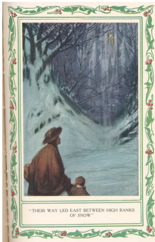
"THEIR WAY LED EAST BETWEEN HIGH BANKS OF SNOW"

" He might not come till Christmas is 'way past," Ellen thought, following. "She'll leave it standing a few days. We can go down there and look at it—if he comes."