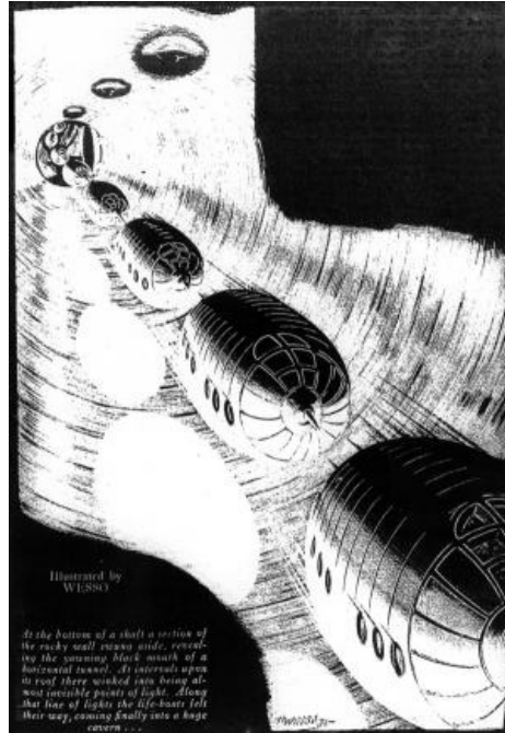
At the bottom of a shaft a section of the rocky wall swung aside, revealing the yawning black mouth of a horizontal tunnel. At intervals upon its roof there winked into being almost invisible points of light. Along that line of lights the life-boats felt their way, coming finally into a huge cavern....

"Maybe, and maybe you're trying to kid somebody," she returned, eyeing him intently. "Or maybe you just don't want to answer those questions I asked you a minute ago."