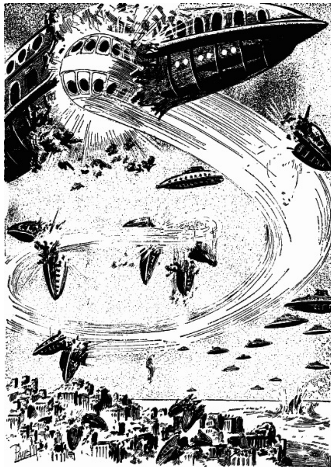
The Skylark darted forward and crashed completely through the great airship.... She was an embodied thunderbolt; a huge, irresistible, indestructible projectile, directed by a keen brain inside....

They buckled their belts firmly, and Seaton, holding the bar toward their nearest antagonist, applied twenty notches of power. The Skylark darted forward and crashed completely through the great airship. Torn wide open by the forty-foot projectile, its engines wrecked and its helicopter-screws and propellers completely disabled, the helpless hulk plunged through two miles of empty air, a mass of wreckage.