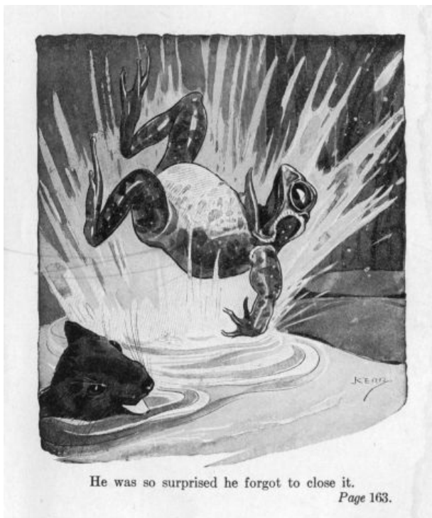
He was so surprised he forgot to close it. Page 163.

You see he was so surprised he forgot to close it. So, of course, Grandfather Frog swallowed a great deal of water, and he choked and spluttered and swam around in foolish little circles trying to find himself. Finally he climbed out on his big green lily pad.