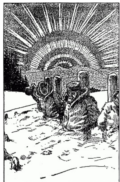
"The terrible cold was making them stupid"

He looked over at his son and Fred. They had not spoken nor moved in some time. The cold was making them numb. Even Mr. Baxter, hardened as he was, felt a deadly calm stealing