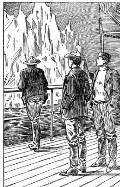
"The glittering pinnacles towered high in the air"

The sailor proved a good prophet, and that afternoon the steamer passed an immense berg, the glittering pinnacles of which towered high into the air. The presence of it added to the cold, which was becoming sharper every hour.