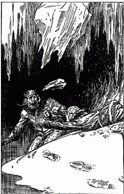
"The force of the blow shoved the man ahead"