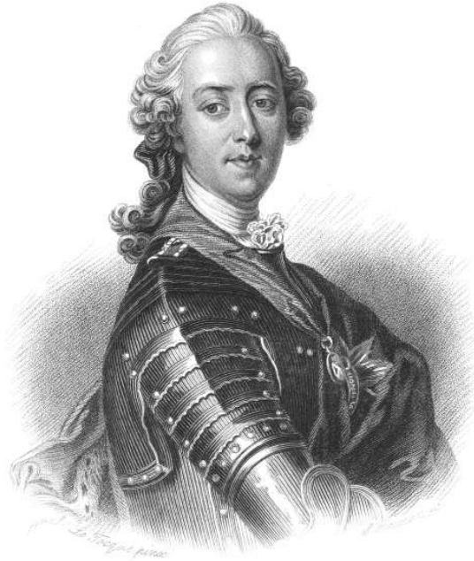
Le Toque, pinx.

"According to justice and your wisdom's answer, &c. &c."