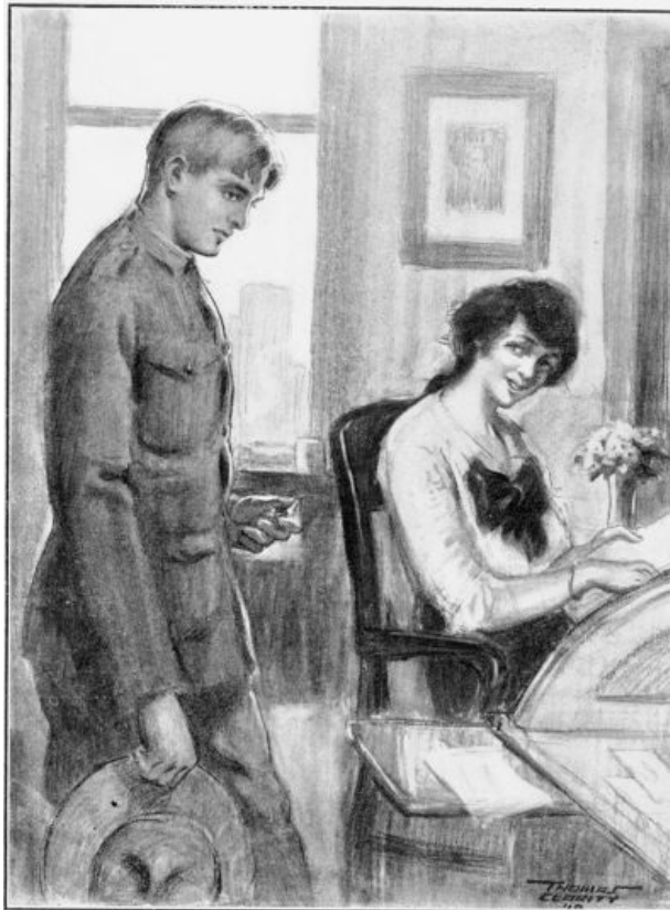
MISS ELLISON GREETED TOM WITH A MYSTERIOUS SMILE.

*** START OF THE PROJECT GUTENBERG EBOOK TOM SLADE WITH THE COLORS ***