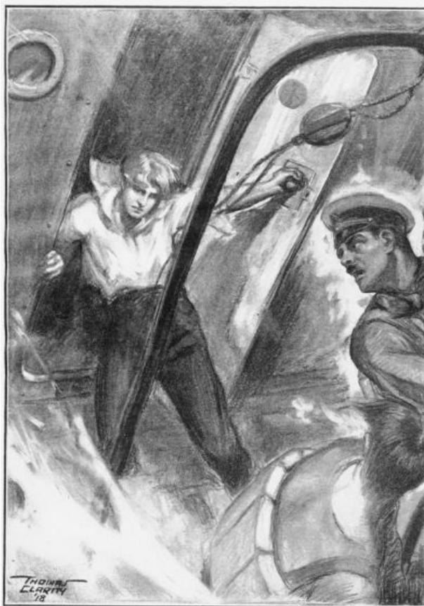
THE LAST THEY SAW OF TOM, HE WAS CLINGING TO ONE OF THE FLAPPING DOORS, HIS FOOT BRACED AGAINST A CABLE CLEAT. Page 174

Roscoe Bent had thrown his chair back and without so much as excusing himself had stridden over to the bay window, where he stood holding the curtain aside and looking out.