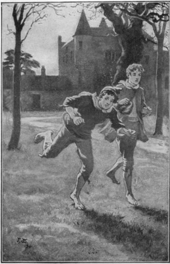
"Sped like hunted hares down the avenue."