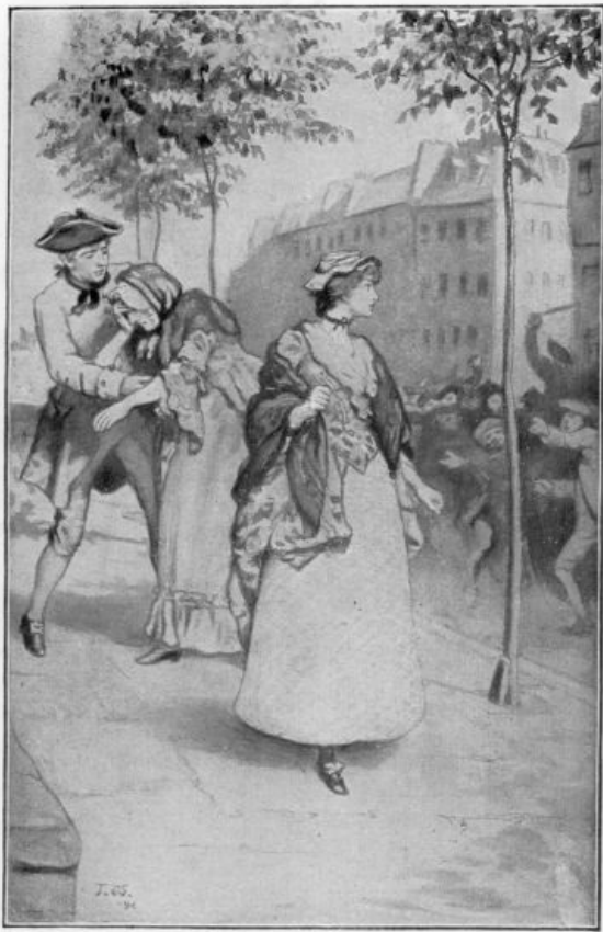
"Miss Kit's face was as white as marble."