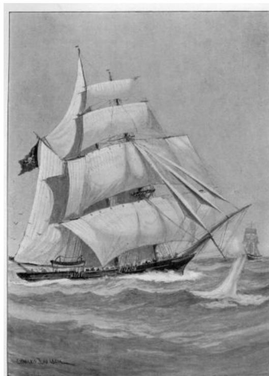
“HEAVE A SHOT ACROSS THE RASCAL'S FORE-FOOT.”

“My lads, you have all heard of the atrocious pirate Morillo who haunts these waters; you have heard something of his doings from those poor fellows belonging to the Wyvern who were picked up by us when we were searching for the Althea's boats, and you saw for yourselves a specimen of his handiwork in the blazing hull of the Kingston Trader , the unfortunate crew of which ship only too probably perished with her. The scoundrel and his gang of cold-blooded murderers are aboard that brigantine; and after what you have heard and seen, I need not tell you what is likely to be the fate of any of us, or of those aboard the Dolores , should we be so unfortunate as to fall into their hands. They are undoubtedly about to attempt the capture of the Spaniard. Now, it is for you to say whether they shall do so, or whether you will send them all to the bottom of the sea instead. Which is it to be, men?”