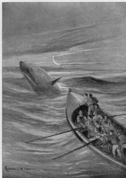
"BACK WATER FOR YOUR LIVES!"

Another long sigh-like expiration abruptly interrupted the yarn, and close under our bows there rose another leviathan, so closely indeed that, unless it was a trick of the imagination, I felt a slight tremor thrill through the boat,