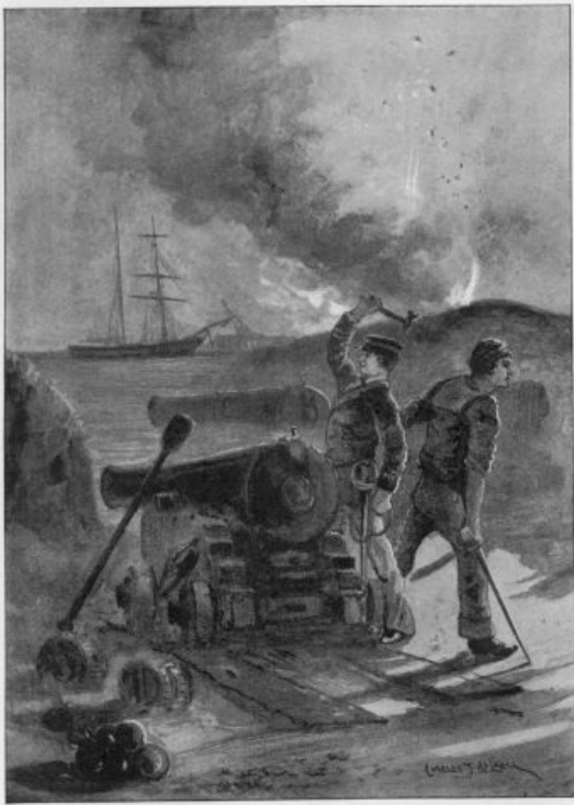
TEN MINUTES SUFFICED US TO SPIKE THE GUNS.