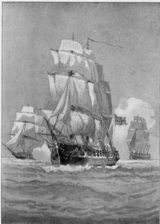
IN LESS THAN A MINUTE TWO GUNS SPOKE OUT.

They stood on, silent as the grave, until the craft on our larboard quarter—which was leading by about a couple of lengths—had reached to within a short quarter of a mile of us, when, as we all stood watching them intently, a jet of flame, followed by a heavy burst of white smoke, leapt out from her starboard bow port, and the