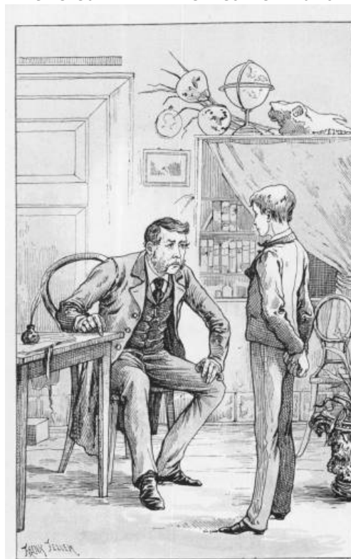
"I HAVE A GOOD MIND TO HAVE YOU FLOGGED."

Half-holidays did not necessarily preclude work in the tutor's pupil-rooms, which was preparatory to that in school, though practically the hours of recreation were never interfered with in fine weather. But after the hour of "All In," as