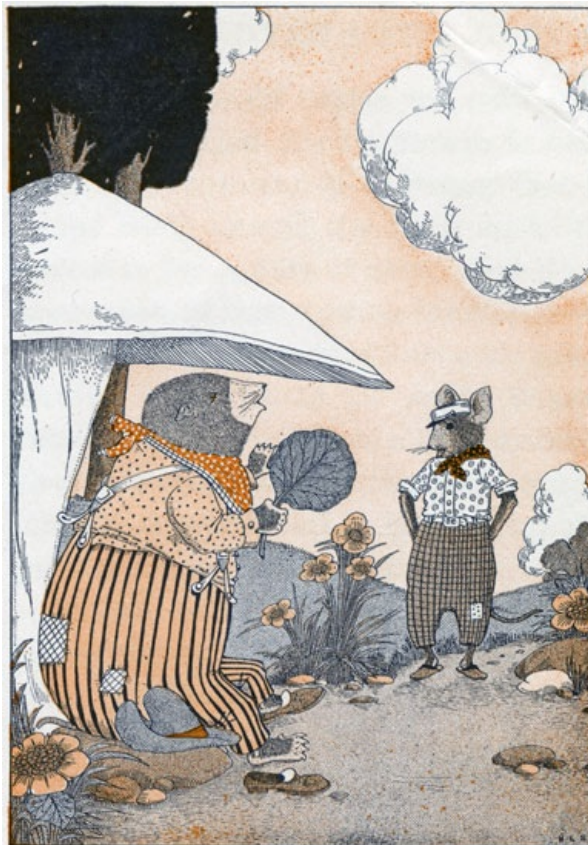
Grandfather Mole Greet Mr. Meadow Mouse.

Mr. Blackbird replied that he was glad to know it.