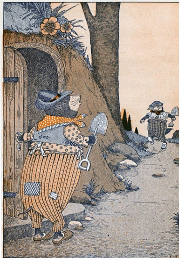
Billy Woodchuck Calls on Grandfather Mole.

"Here he is!" Mrs. Wren called to Grandfather Mole. "I've found him. Do you want to come and get him, or shall I bring him to you?"