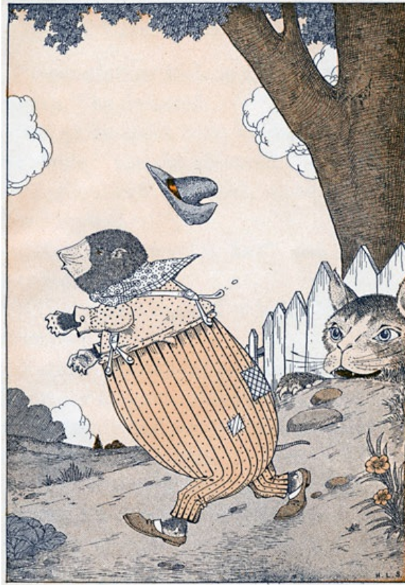
Grandfather Mole Escapes From Miss Kitty.

Mr. Crow was rocking back and forth on his perch, for a joke—on anybody except himself—always delighted him.