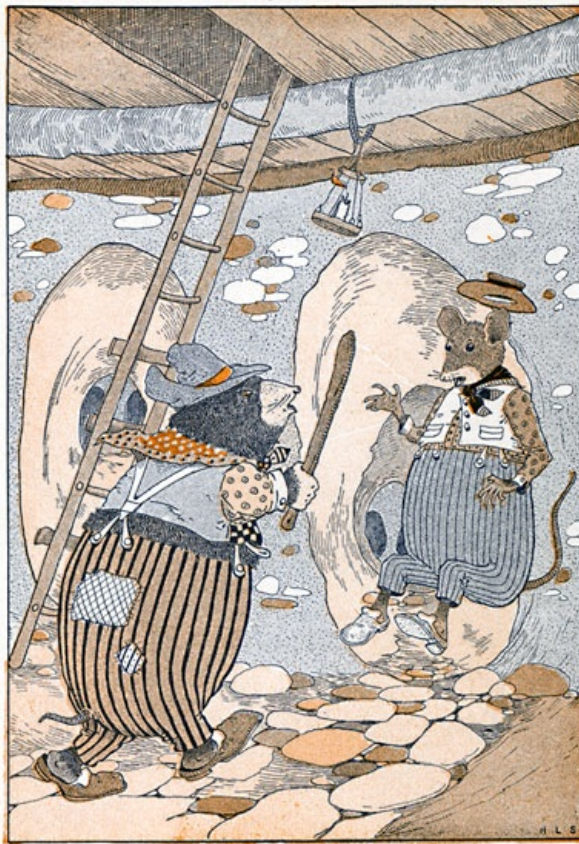
Grandfather Mole Made a Rush for Mr. Meadow Mouse. Frontispiece (Page 85)

THE TALE OF BROWNIE BEAVER THE TALE OF PADDY MUSKRAT THE TALE OF FERDINAND FROG THE TALE OF DICKIE DEER MOUSE THE TALE OF TIMOTHY TURTLE THE TALE OF MAJOR MONKEY THE TALE OF BENNY BADGER