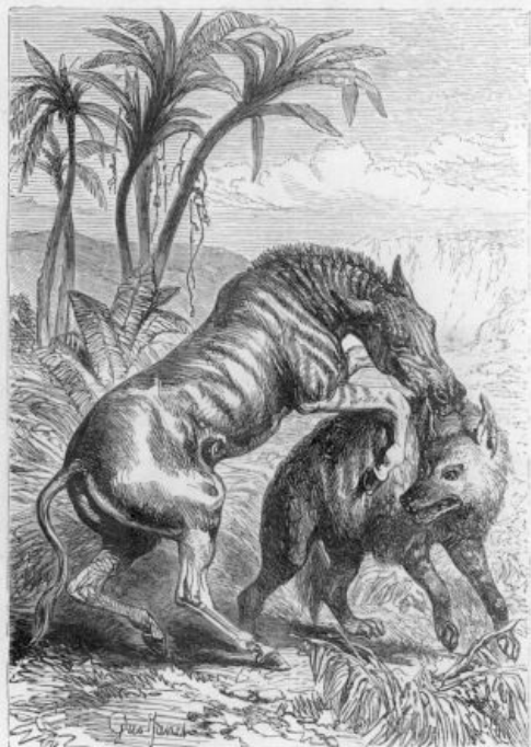
THE QUAGGA AND THE HYENA.

The animal in question was browsing quietly along, and at length approached a small clump of bushes that stood out in the open ground. When close to the copse it was observed to make a sudden spring forward; and almost at the same instant, a shaggy creature leaped out of the bushes, and ran off. This last was no other than the ugly