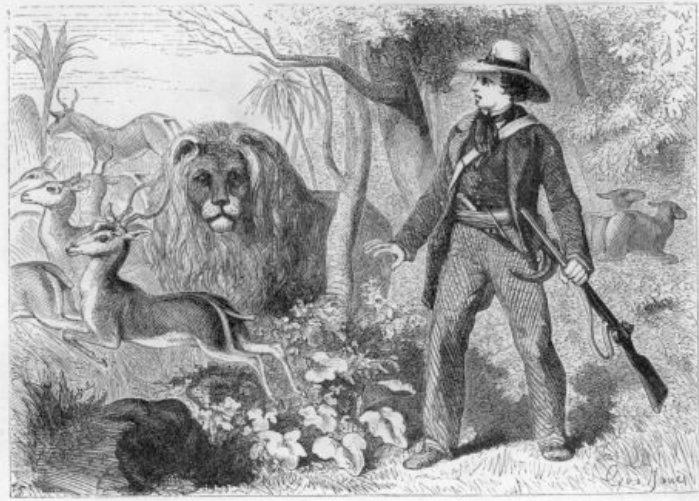
HANS'S ENCOUNTER WITH THE LION.—Page 129.

"That accounted for the break in the herd. Had I known what had been causing it,