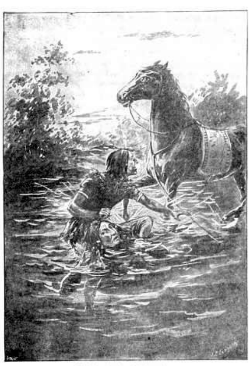
Sinking in the Quicksands