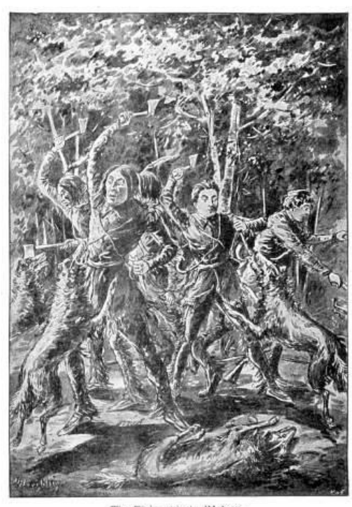
The Fight with the Wolves.