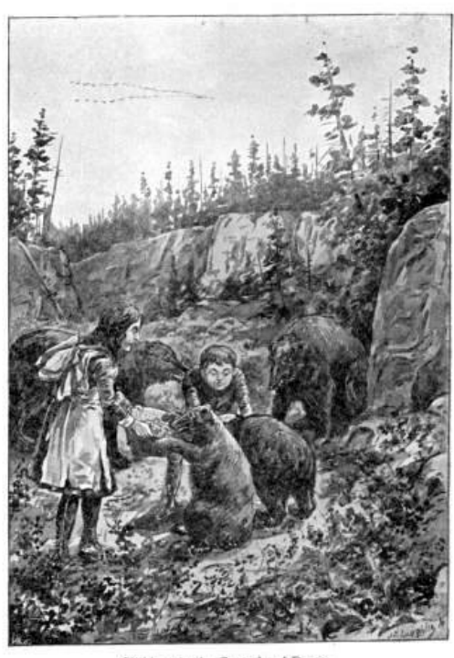
Children in the Custody of Bears

His story was this: he had pushed on in the direction he had selected in the hunt for the children, and toward evening he had reached a part of the country where the berries were very plentiful. Here he had found traces that bears were numerous, and as they are fond of these berries they had been feasting on them. This, of course, alarmed him, and so he cautiously began making a circle around this place, and at length, in a depression in the forest, he found the dried-up channel of a creek. He cautiously hurried along on the dry sands, and, after going on only a few hundred yards, he found a number of fresh tracks, not only of bears that had recently crossed but also among them the footsteps of the lost children!