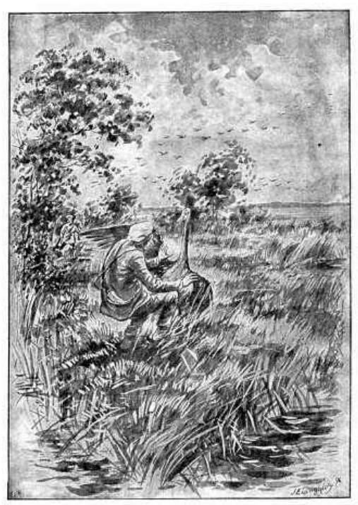
Knocked Out by a Goose.

Poor fellow, when picked up he could hardly tell what had happened, only that it seemed to him he had been pounded with sledge hammers and had seen some thousands of stars.