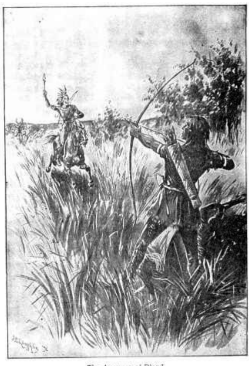
The Avenger of Blood.

"I was more fortunate with the other noose, for in it was caught by the neck a fine young plump prairie dog. Quickly killing him, I carried him and the two strings back to the protection of my horse. As I had my knife, it did not take me long to skin the prairie dog, and as I had no fire I had to eat him raw. It tasted very good, for I was now feeling very hungry. As I had done the night before, I slept with my horse close to me as a protection from the wolves."