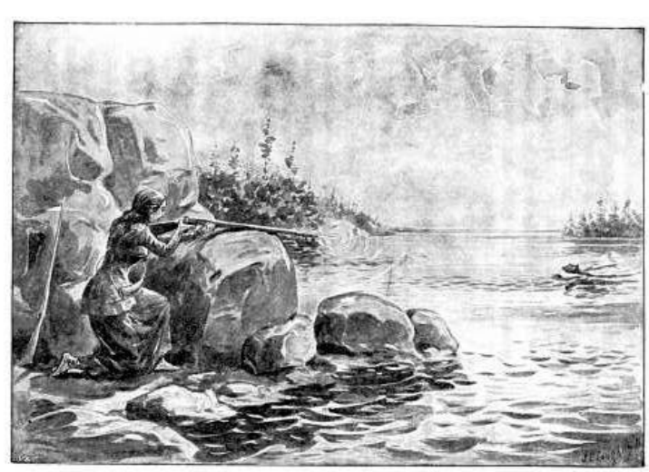
A Woman's Successful Shot.

Of course this wounded arm must be promptly attended to more thoroughly than it could be on this wild spot, and so every Indian was set to work to skin the wolves, and then the home trip began.