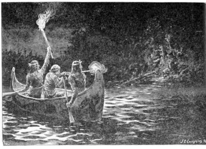
Shooting Deer by Torchlight.

"This great scar remains with me to this day, and reminds me of that fierce fight, and tells of how terrible in those days were some of the doings of our people."