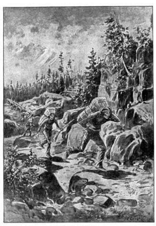
Making a Portage

perhaps that simple but impressive service did more to bring vividly and helpfully before them the memories of their happy Christian homes far away than anything else that had occurred since they left them.