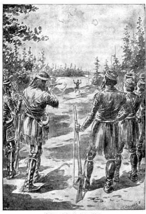
Defeat of the Medicine Man.

In the management of the canoe the white boys never learn to equal the Indian lads, neither could it be expected that they could attain to the accuracy with which they use their bows and arrows; but in all trials of physical strength the Anglo-Saxon ever excels, and, surprising as it may appear to some, in shooting contests with gun or rifle the pale faces are ever able to hold their own.