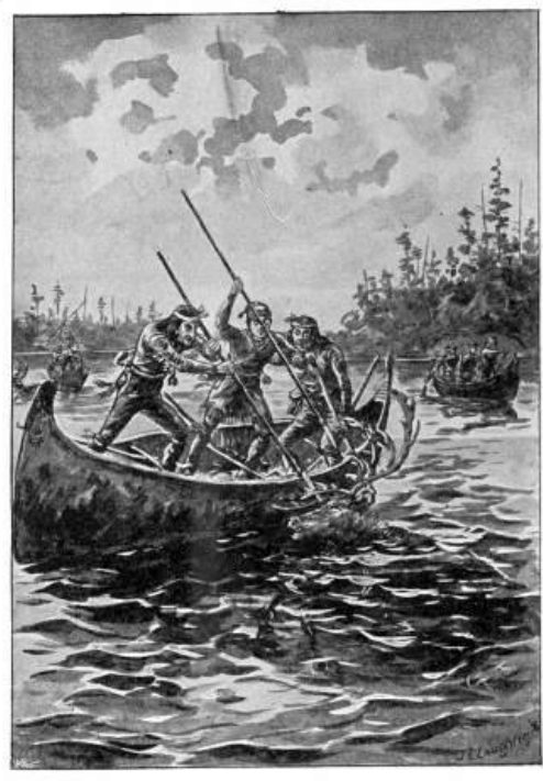
Reindeer Attacks the Cance.

With quiet actions, and yet with happy hearts, they returned to the camp from the long stroll.