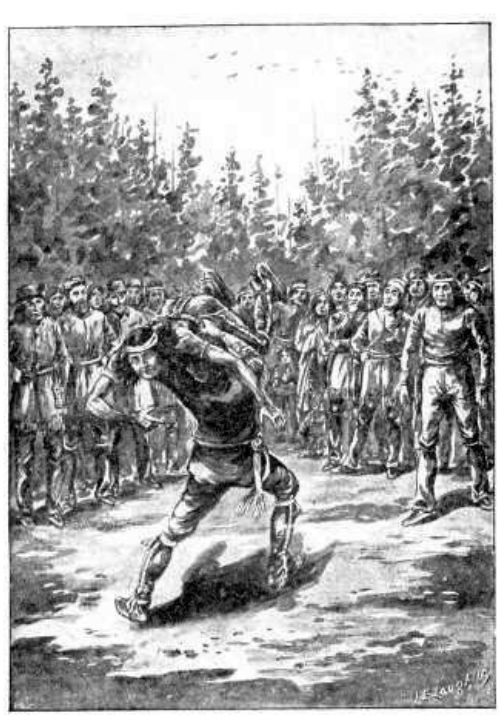
The Wrestling Match