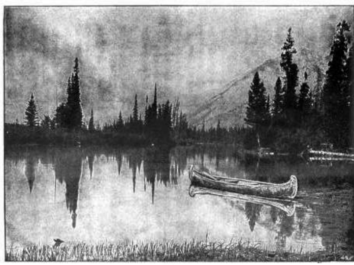
A Painter's Vision, a Poet's Dream.

The return to Sagasta-weekee was made in a few days. With the exception of an upset of a canoe in one of the rapids, where they were trying to work up stream instead of making a portage, nothing of a very startling nature occurred. Alec was the boy who was in this canoe, and he was quite carried under by the rapid current, and only reappeared above the surface a couple of hundred feet lower down. Fortunately there were some canoes near at hand, and he was quickly rescued. But the accident gave them all a great fright. They lost everything in the canoe that would not float. They most regretted the loss of three reliable guns. After this they were much more cautious, and the boys were taught the admonitory lesson that these sports and adventures were not to be enjoyed without many risks, and that there was at all times as great (a) demand for caution and watchfulness as there was on certain occasions for daring and courage.