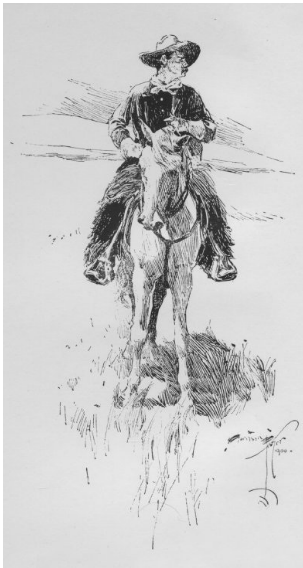
HE DREW REIN AND LOOKED AT THE GREAT RANGE TO THE SOUTHEAST.

*** START OF THE PROJECT GUTENBERG EBOOK THE EAGLE'S HEART ***