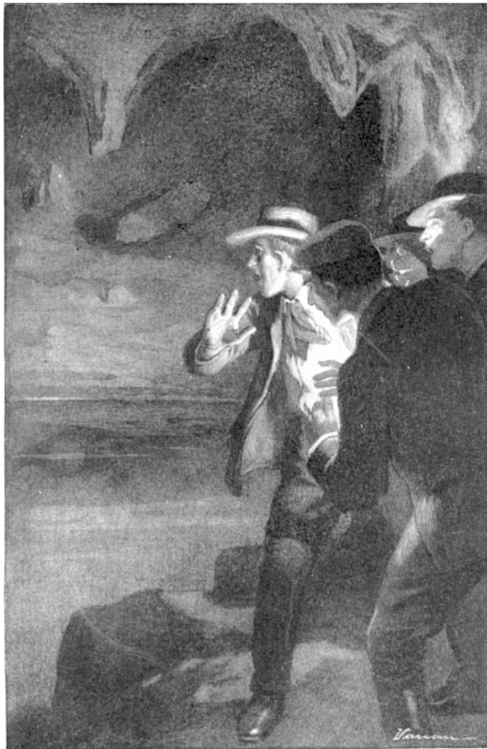
In the Cave