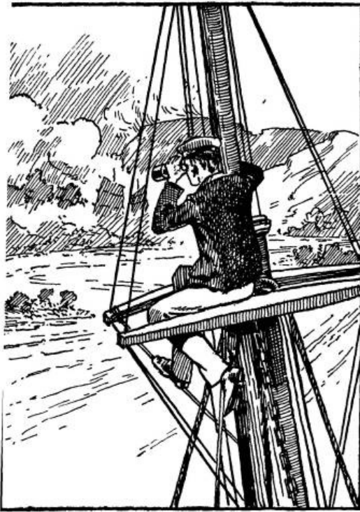
*MY HANDS WHICH HELD THE TELESCOPE WERE QUITE WET WITH EXCITEMENT.*—Page 164.

"About two hundred yards, sir; you'll see them directly."