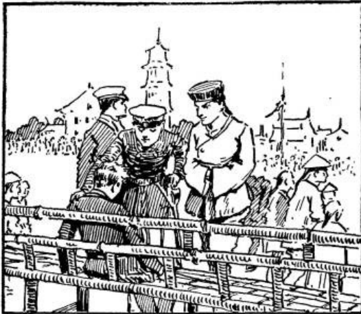
"THE SWORD FLASHED." Page 218.

The man shouted out some words angrily, and Ching interpreted them in my ear, his explanation being in company with a strange surging noise—