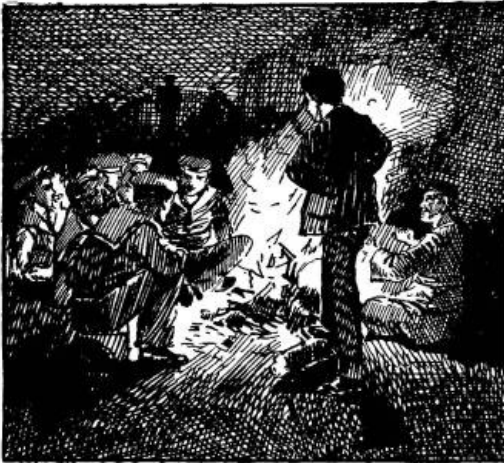
'MAKES A BIT OF A CHANGE, SIR.'

Mr Brooke walked to the sentinels, and for want of something else to do I stood pitching pieces of drift-wood on to the fire, for the most part shattered fragments of bamboo, many of extraordinary thickness, and all of which blazed readily and sent out a great heat.