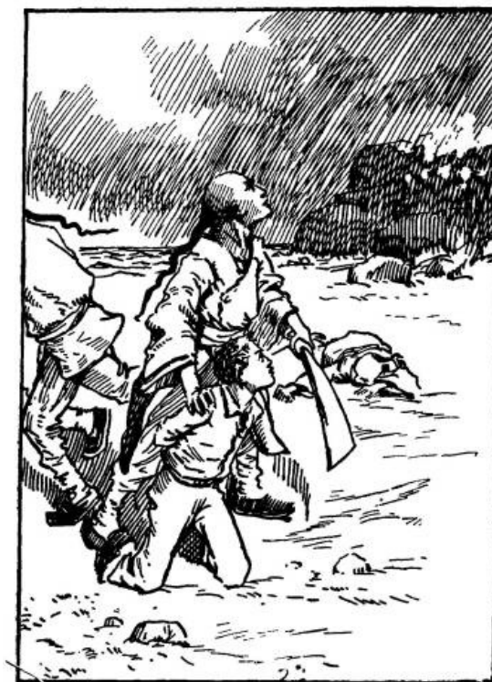
IT WAS NOT THE FALLING OF THE SWORD ON MY POOR OUTSTRETCHED NECK.—Page 376.

I don't think they meant to kill him, their rage being evidently directed at us; and I saw, with a peculiar kind of