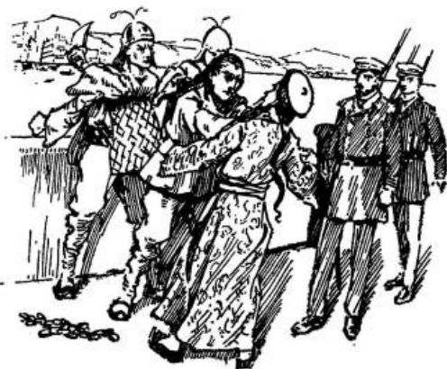
'A RUSH AT THE MANDARIN.' Page 143.

The incident did not seem to discompose the Chinese, who disposed of the next prisoner. And then I saw that the marines had charge of another, who suddenly made an attempt to escape, and our men only having one hand, at liberty, the other holding a rifle, he would have succeeded, had not six or seven of the soldiers rushed at and seized him, dragging him to the lessening heap of chains, when he suddenly threw up his hands and dropped upon his knees, throwing them off their guard by making believe to resign himself to his fate.