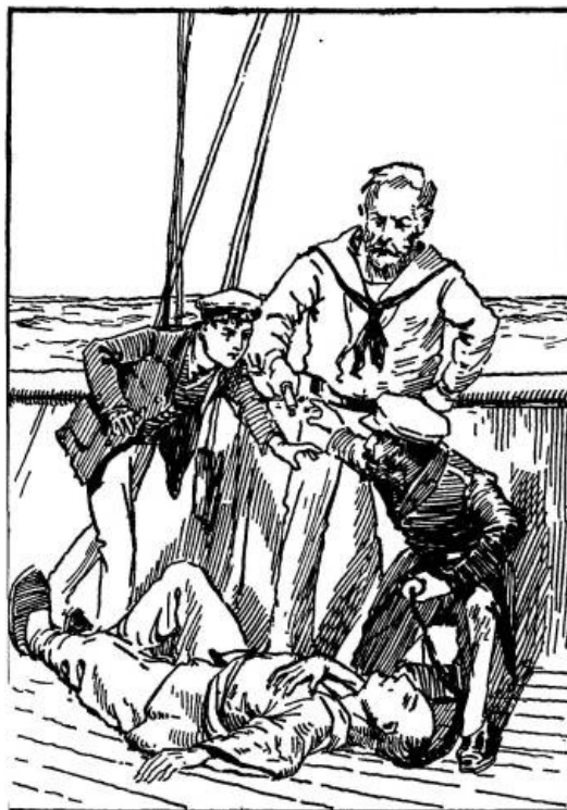
"HE'S ALL TWISSEN."—Page 237.

"Found him?" cried the captain, who now came up.