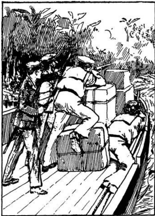
'WE COULD HEAR THEM CREEPING NEARER THROUGH THE BUSHES ON OUR RIGHT.'—Page 196.

"No, no," I cried the next moment. "How could we get at the tiller?"