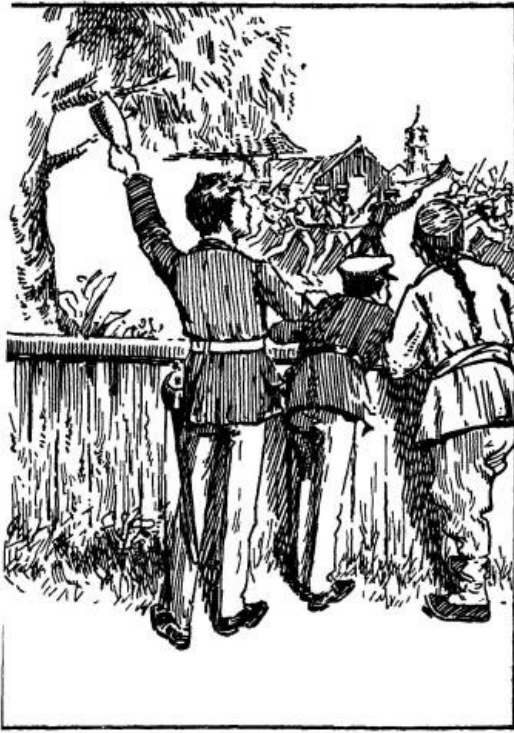
'I SAW THE MOB IN FULL FLIGHT.'—Page 38.

He made a dash for the front of a house, which seemed to offer some little refuge for us in the shape of a low fencing, behind which we could protect ourselves; for all at once there was a new development of the attack, the mob having grown during the last few minutes more daring, and now began to throw mud and stones.