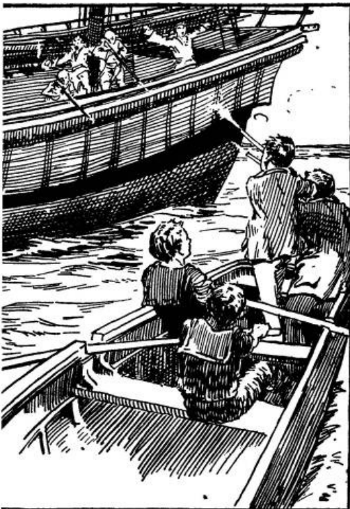
"JUMP, JUMP," YELLED CHING.—Page 333.

"What's the matter?" cried Mr Brooke, making for the side; but in an instant the attitude of the Chinaman changed. One moment the captain was smiling at us smoothly; the next there was an ugly, look in his eyes, as he shouted something to his men, and, thrusting one hand into his long blue coat, he made a quick movement to stop Mr Brooke from going to the side.