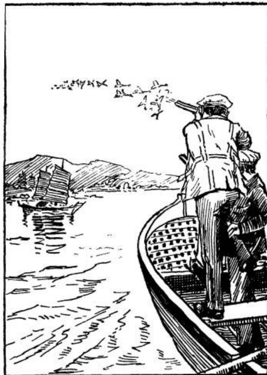
"I TOOK AIM AND FIRED BOTH BARRELS QUICKLY."—Page 268.

"Velly good," whispered Ching. "Allee men in other boat look see;" while I replaced the cartridges in my gun, and looked shoreward, to see that the land was level for miles, and that little flocks of duck or other birds were flying here and there. Soon after a wisp of about a dozen came right over head, and as they approached the men rested upon their oars till Mr Brooke had fired, without result.