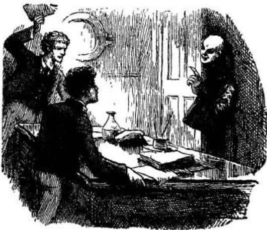
'SOMETHING TO THROW.'—Page 206.

"Yes; there's some game or another on. Let's ask leave, and take old Ching with us."