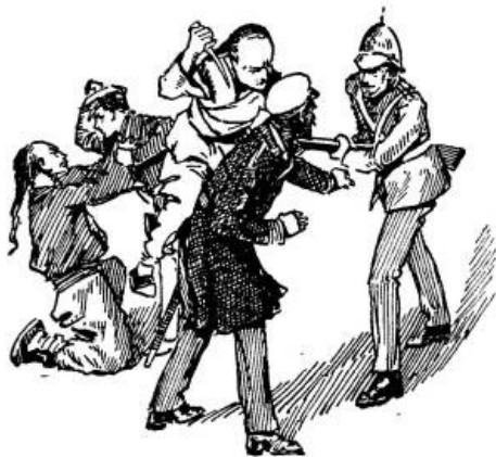
'ON THE LIEUTENANT'S BACK.' Page 121.

"With the butt-end of a rifle, sir; and then we had to wrench his teeth open with bayonets."