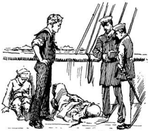
"THE FIRST LIEUTENANT HAD RETURNED."—Page 177.

"Well, take them," said Mr Reardon, who was speaking less severely now. "I'll have the uninjured men in irons this time. Be careful."