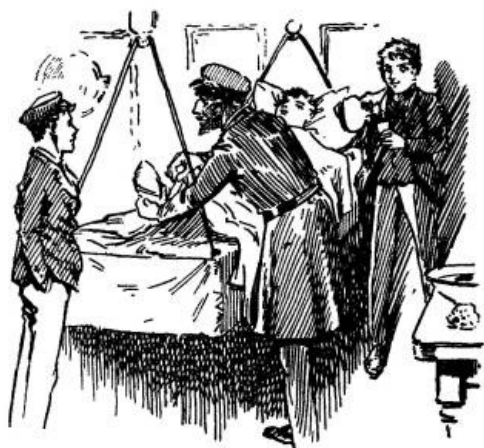
AS IF HE ENJOYED HIS TASK.—Page 114.

"Feel sick and queer. Don't let me faint before him."