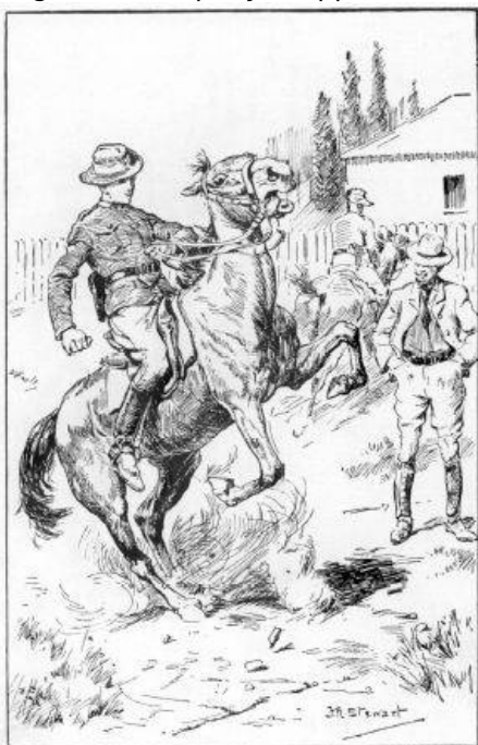
"West's mount reared!"

They both sprang into their saddles, to the intense astonishment of the ponies, one of which made a bound and dashed off round the enclosure at full speed, while the other, upon which West was mounted, reared straight up, and, preserving its balance upon its hind legs, kept on snorting, while it spurred out with its fore hoofs as if striking at some imaginary enemy, till the rider brought his hand down heavily upon the restive beast's neck. The blow acted like magic, for the pony dropped on all-fours directly, gave itself a shake as if to rid itself of saddle and rider, and