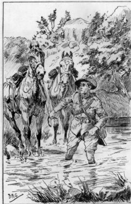
"Ingleborough waded in at once."

Five minutes later Ingleborough proved to be quite correct, for they paused at a rugged archway between piled-up fern-hung blocks, out of which the water rushed in a fairly large volume, but not knee-deep; and, upon leaving his