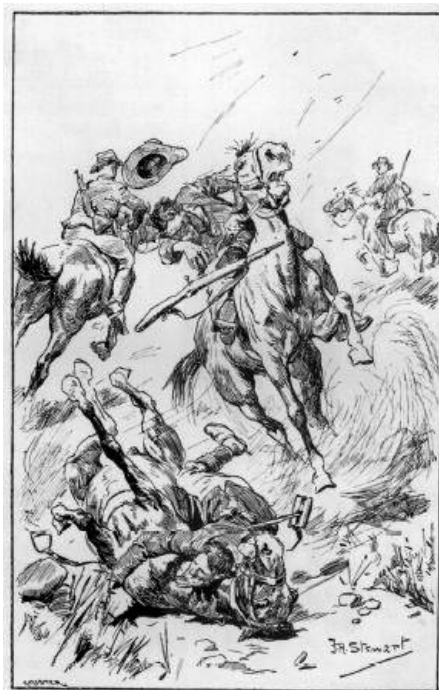
"One horse went down headlong."

It was not the distance but the pace that was killing, and Ingleborough was right. To have stopped and turned to fire, with their pulses throbbing, breath coming in a laboured way, every nerve and muscle on the jump, must have resulted in missing; and the next moment the enemy would have ridden over them and they would have been either shot or prisoners.