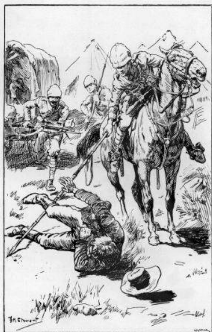
"Anson went sprawling over a lance shaft."

Then he stood fast with his brow wrinkled and his hands clenched, waiting expectantly with the rest of those present until the cask was set free from the raw-hide reins by which it was slung under the hind