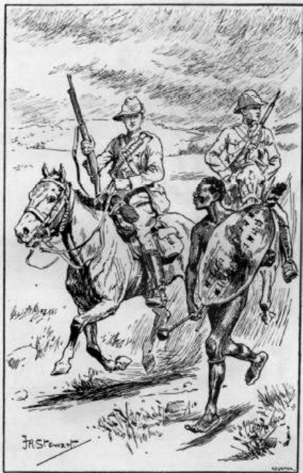
"The Kaffir ran lightly by the pony's side."

"No more wire fence!" said their guide, and indicating that they should urge the ponies forward he took his shield and spears from Ingleborough, caught hold of the mane of West's pony, and then as they broke into a canter, ran lightly by the animal's side, talking softly, and now and then breaking out into a merry laugh.