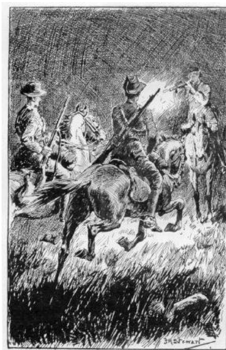
"The Boers kept on firing."

For no sooner had West spoken than there was a sharp challenge to left and right, running away along a line, and directly after the reports of rifles rang out and bullets whizzed like insects through the dark night air. Many flew around and over the heads of the fugitives; for the moment the discovery was made West and Ingleborough pressed their ponies' sides and went forward at full gallop to pass through the fire in front of them.