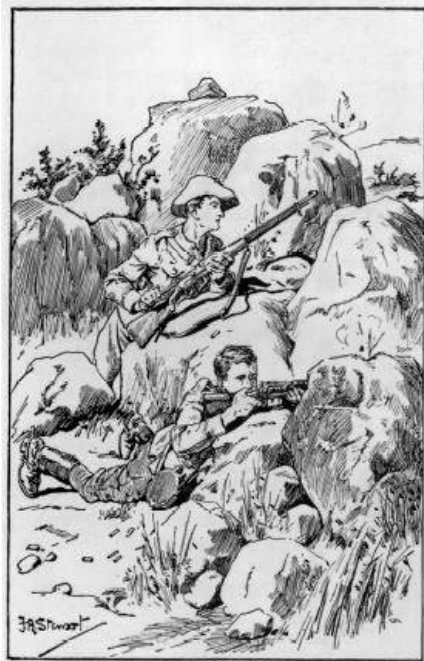
"'No good to play that game,' cried Ingleborough."

But the danger did not trouble West. It only increased the excitement from which he suffered, and, with his eyes