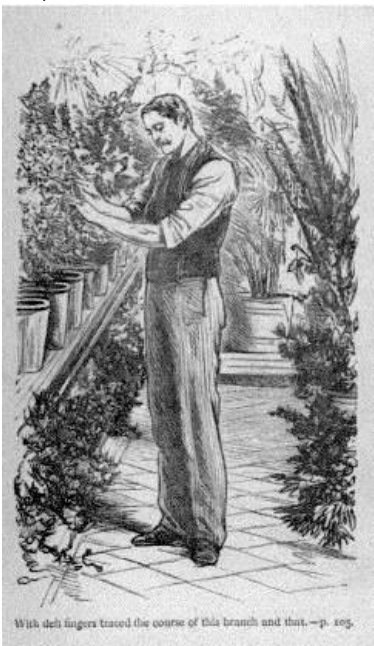
With deft fingers traced the course of this branch and that.—p. 205.

For there, to his utter astonishment, was John Grange, bright-eyed, erect, and with his face lit up with eager pleasure, busily tying up a plant to the sticks from which its strands had strayed. A few pieces of raffia grass were hung round his neck, his sleeves were turned up, and, evidently in utter ignorance of the fact that he was being watched, he bent