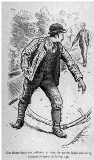
One sharp thrust was sufficient to raise the scythe blade and swing it across the green path.—p. 145.