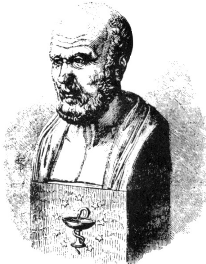
BUST OF ÆSCULAPIUS.