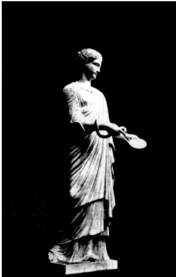
Plate II.—HYGEIA The Greek Deity of Health.

Many of the Greek gods and goddesses were held to have power over disease. Hygieia, known as Salus to the Romans, was said to have been the daughter of Æsculapius, and to have taken care of the sacred serpents (Plate II).