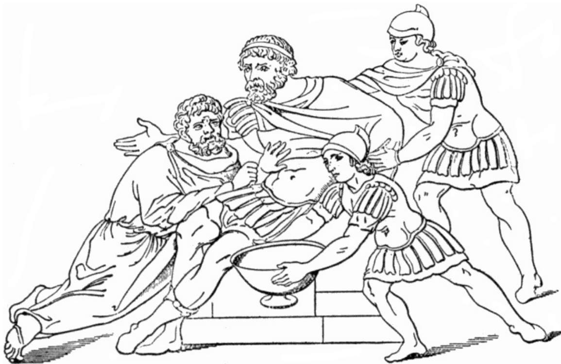
Machaon (Son of Asklepios), The first Greek military surgeon, attending to the wounded Menelaus.

Machaon fought in the army of Nestor. Fearing for his safety, King Idomeneus placed him under the charge of Nestor, who was instructed to take the doctor into his chariot, for "a doctor is worth many men." When Menelaus was wounded, a messenger was sent for Machaon, who extracted the barbed arrow, sucked the wound and applied a secret ointment made known to Æsculapius by Chiron the Centaur, according to tradition. [Pg 17]