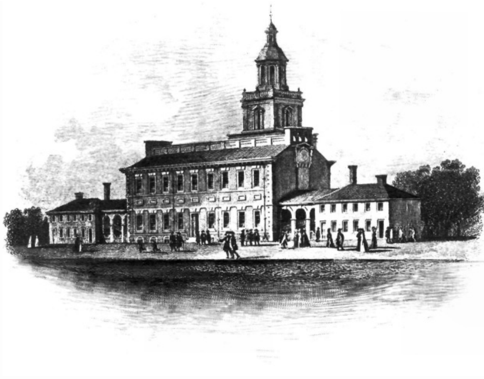
Independence Hall, Philadelphia, 1776