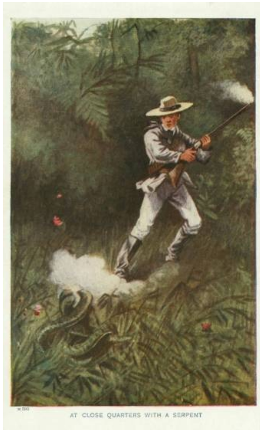
AT CLOSE QUARTERS WITH A SERPENT

"Fire at its head, Nat," cried my uncle; but it was not easy to see it, for the creature kept on twining about in a wonderfully rapid way; but at last I caught it as the head came from behind a tree trunk, fired, and the monster leaped from the ground and fell back in a long straight line, perfectly motionless, till Ebo darted in to give it a final thump with his club, when, to my astonishment, the blow seemed to electrify the creature, which drew itself up into a series of waves, and kept on throbbing as it were from end to end.