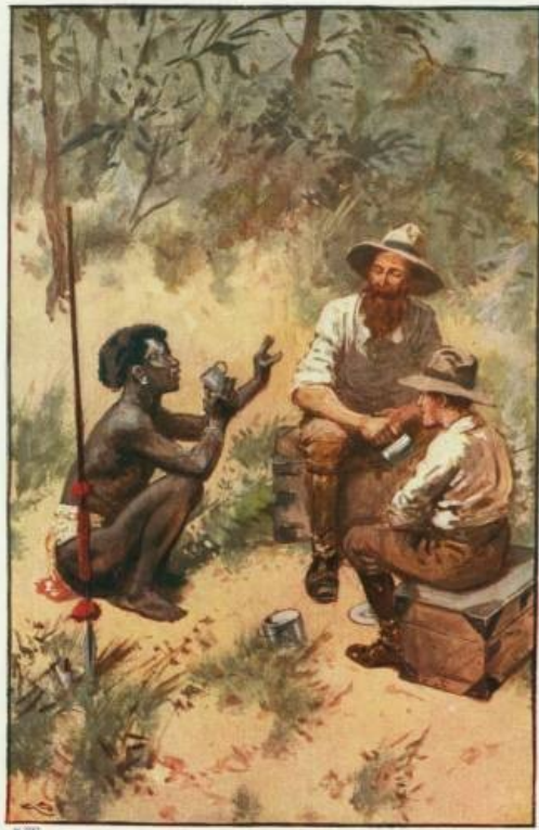
AT BREAKFAST WITH A NEW FRIEND

The savage evidently saw them at the same moment, for he made a rush towards the dark figures that were stealing from tree trunk to tree trunk, and we saw them dash away directly out of sight, after which the savage came sidling in our direction again.