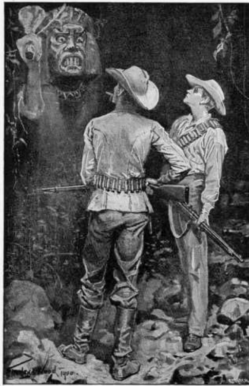
“‘How are you, old chap?’ said Briscoe quietly.”