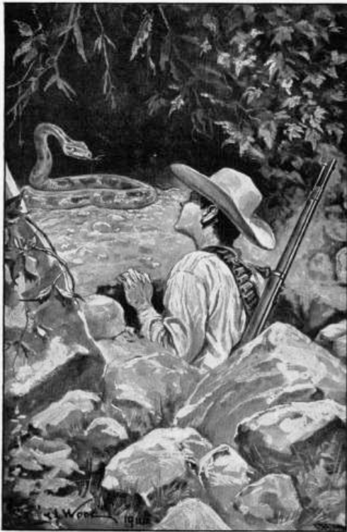
"A serpent raised its head, ready to strike."

"I thought so," said Briscoe. "Here: I'll go in first."