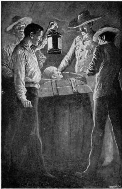
“Well, Dan, how goes it?” said the American.” (P. 94)

The captain turned upon the man fiercely, but it had not the slightest effect upon him, for he kept his cigar in his mouth and smoked away, as he drew out a key like that used for the boot of a coach, thrust it into one of the holes in the head, gave it a turn, and the head of the cask opened outward in two pieces which turned upon hinges; while as the first mate thrust forward the lanthorn he held, it was nearly knocked out of his hand by the skull-cap-covered head which shot up, sending a thrill of relief through the circle of lookers-on.