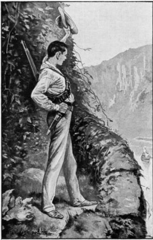
"Brace uttered a loud cheer and stood waving his hat." (P. 381.)

For all at once there arose a peculiar rushing sound, and as everyone crouched as low as he could, he was conscious of the whistling of wings in rapid flight and the ammoniacal odour of a great stream of birds passing over them to reach the outlet from the passage into the open air.