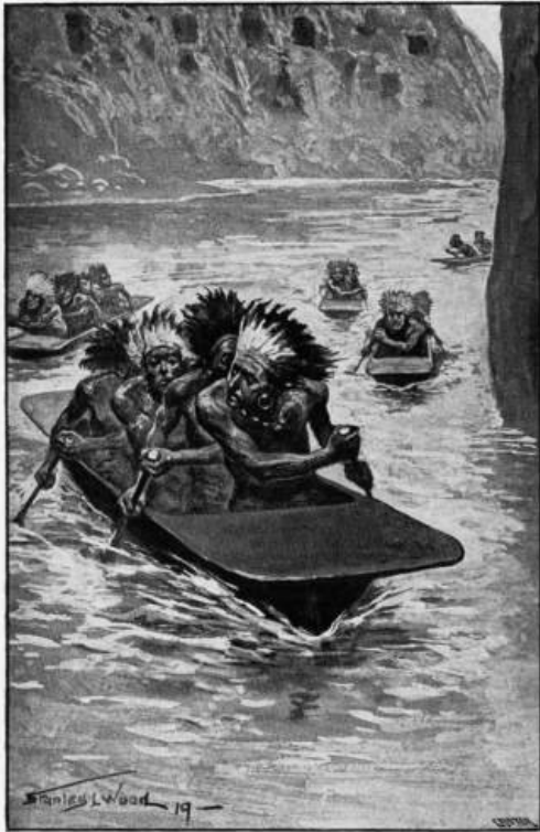
"Every man forced the canoes to their greatest speed."

Brace had hardly swept the face of the strangely-worked range of cliff when the softly mournful chorus ceased, and as if moved by one impulse, on catching sight of the approaching boats, the Indians burst forth into a shrill piercing yell which echoed and re-echoed discordantly from the face of the rocks. The next moment every man had seized his paddle, and they were making the river foam and sparkle with the vigour of their strokes.