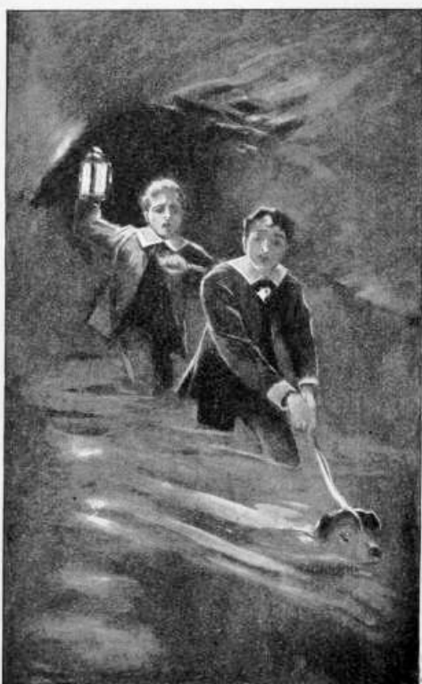
'Holding the light well up they waded on.'

"Well, we must go on now. Perhaps it's the way he came."