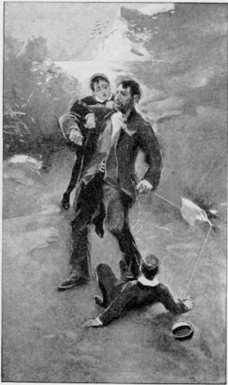
"Gwyn! Gwyn! Help!" he shouted.

Joe had a good start, and the advantage of being light and accustomed to make his way among the heath and stones; but he soon found that the weight at the end of the line kept on catching in the rough growth; and as he tore on, he saw that the fierce-looking fellow was in full pursuit. If he had dropped the line, he could easily have got away, but Gwyn had thrown that reel to him, and told him to run with it; and setting his teeth he ran on, jerking the weight free again and again, till all at once in one of the bounds it made after a heavy drag, it struck against a small post-like piece of granite which stuck up out of the ground, swung round and clasped it, as the bolas of a South-American