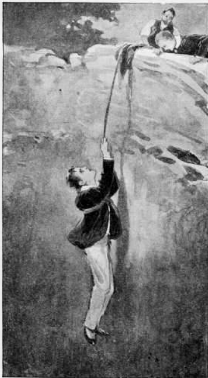
'The next moment he was being lowered.'

"Then, here you have it. I just make a knot like this about your chesty, so as it don't grow tight and can't slip. That's your sort. How's that?"