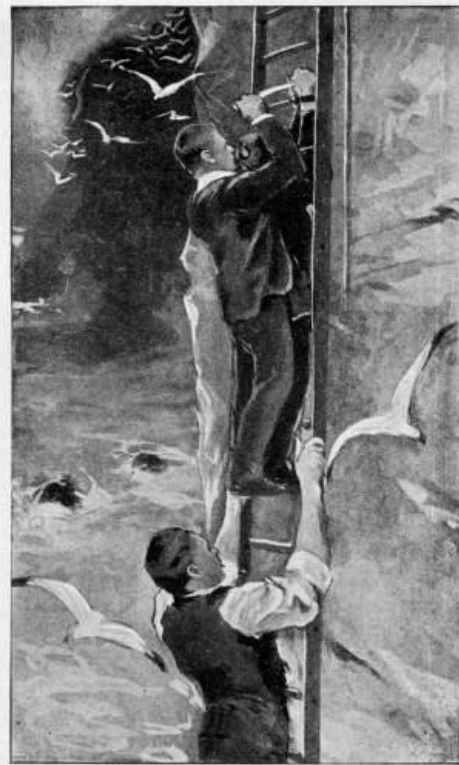
'Gwyn forced the knife-point steadily through the silk.'