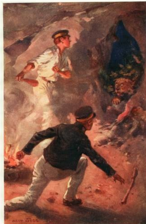
"THE NEXT INSTANT WE CAUGHT SIGHT OF THE SAVAGE-LOOKING HEAD OF ONE OF THE MONSTERS."

"We had not long to wait before we heard her barking, for strange to say, though she was like a pig she did not grunt. She was calling to her solitary young one to get up, I suppose. Presently we felt a pull on one of our lines, and directly afterwards the other was drawn taut. We gave each of them a jerk, and then springing forward with our sticks, we were just in time before the capybara drew back into her hole to give her a couple of stunning blows on the head. We quickly had her out, and a few more blows deprived her of life. It occurred to us that if we dragged her up to our cave, the track might lead any passer-by to it. We therefore fastened her legs together, and carried her on one of our