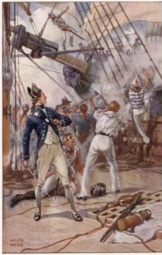
"Pushing the lieutenant aside, he fired at the Frenchman."

"I don't envy Bill up on deck there," remarked Tom. "I wonder what the first lieutenant wants with him."