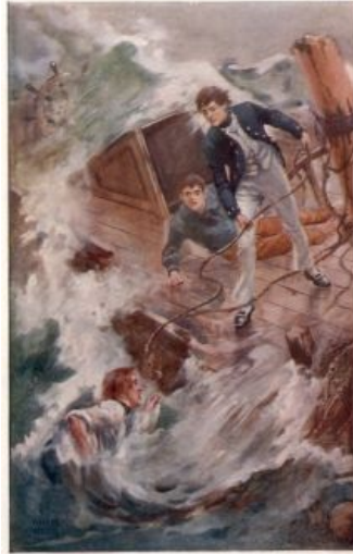
"He clutched the rope which Oliver hove to him."

It of course occurred to Rayner that if Oliver could manage to float a cask, or even a piece of plank secured to the end of a rope, a communication might be established between the wreck and the shore; but as far as he could see,