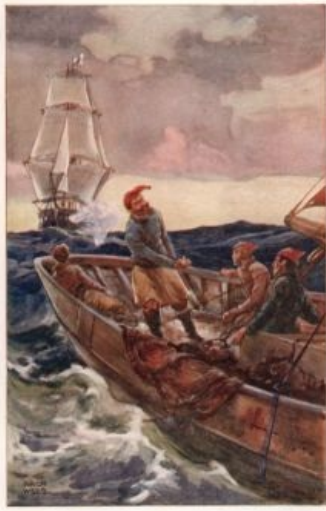
"A shot came jumping over the water towards them."

Matters began to look serious, when a flash and wreath of smoke was seen to issue from one of the bow guns of the frigate, and a shot came jumping over the water towards them. It did not reach them, however.