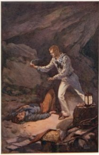
“There lay a figure stretched upon the ground.”

Sometimes he thought that Jack might, after all, not have come to the cavern; but, then, who could have carried away the basket?