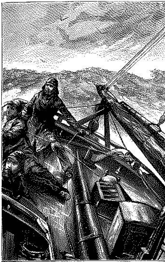
AWAY WE LAS EEDRGE THE WIND.