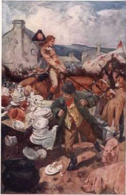
"On he went, upsetting a booth of crockery and scattering the contents."

At the same instant numbers of fellows in frieze coats, brogues, and battered hats, rushed forth from the various tents, flourishing their shillelahs, and shouting at the tops of their voices, some siding with the fallen man, others with the victor, till a hundred or more were ranged on either side, all battering away, as fast as they could move their arms, at each other's heads. Now one party would scamper off as if in flight; then they would meet again,