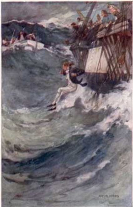
"Next instant Tom was in the water."

I pointed out to him the distance the ships were from us, and the impossibility of reaching one of them. Some of the poor fellows launched their rafts overboard, but were quickly swallowed up by the sea. Even the lieutenants went below; and, strange as it may seem, few of the men remained on deck. Tom Pim and I, however, kept together,