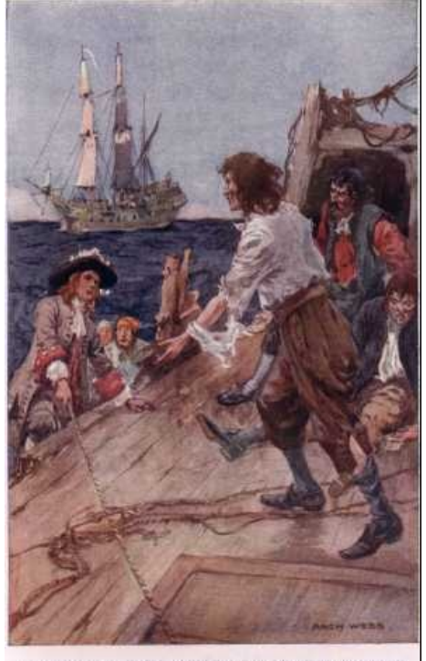
THE BOAT WAR QUICKLY ALONGHUE THE STRANGER, AND ROOFS SCRAMBLED ON BOARD."

Captain Benbow just then made his appearance, and at once issued the order to bring the ship to the wind. The boat was quickly alongside the stranger, a rope was thrown over the side by the man who had been seen waving the flag, and Roger scrambled on board. He and two other men were on foot, weak, and pale, and reduced almost to skeletons, while more lay about the deck unable to raise themselves.