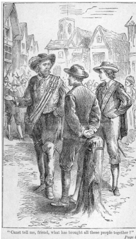
"Canst tell me, friend, what has brought all these people together!"