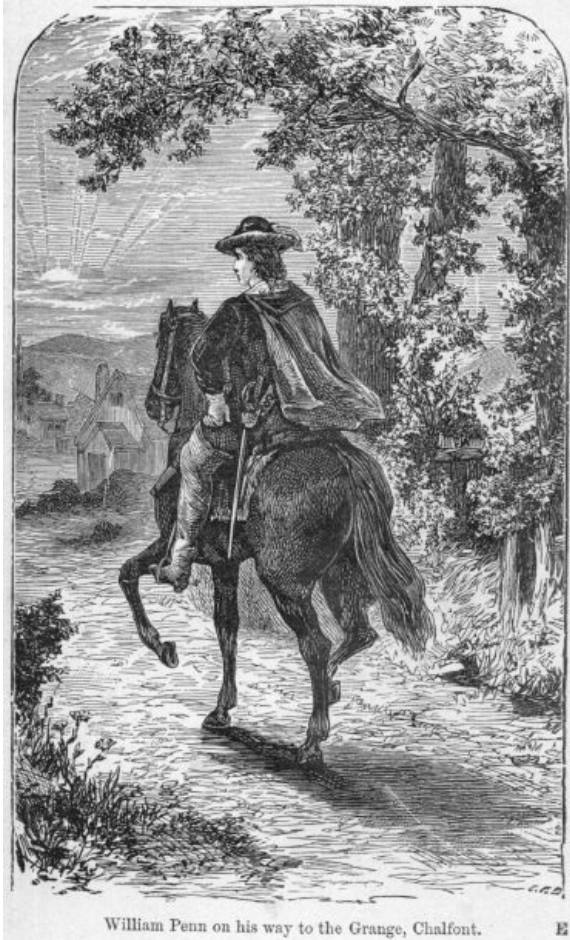
William Penn on his way to the Grange, Chalfont.

The spirit in which the admiral died, greatly softened the poignancy of the grief felt by his wife and son. The funeral procession set forth towards Bristol, where the admiral had desired to be buried, in Redcliffe Church, where a monument, still to be seen, was raised to his memory. William Penn was now the possessor of a handsome fortune inherited from his father. With youth, a fine appearance, fascinating manners, well acquainted with the world, numerous friends at court, and royal guardians pledged to advance his interests, he, notwithstanding, resisted all the allurements which these advantages offered to him, and set forth through the country, travelling from city to city,