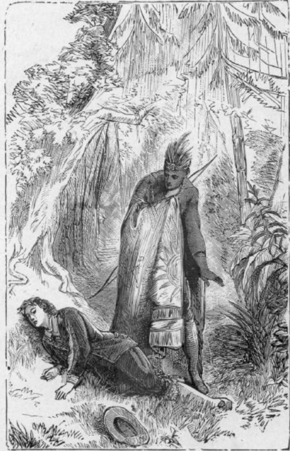
"He saw standing over him a tall Indian."

The old man was at length obliged to acknowledge that Wenlock was right, and to submit. Two or three of the old settlers advised him to take a guide, pointing out the difficulties of traversing the forest; but he, confident in his own knowledge, persisted in his determination. Staff in hand, with knapsack on his back, he set forth. It did occur to him, perhaps, that he should be more at his ease had he possessed a brace of pistols or a musket; but his profession prohibited their use as a means of defence, and he declined accepting some arms from a friendly Swede, who offered them. The weather was fine, and he had learned the art of camping out. Starting early, he marched on bravely all day, believing himself to be in the right course. Once or twice he stopped to rest, and then again proceeded on. At night, collecting a supply of birch-bark, as he had seen the Indians do, he built himself a wigwam. Abundance of fuel was at hand, and, lighting his fire, he cooked some provisions he had brought with him. After this, commending himself to the care of Heaven, he lay down in his wigwam, and was soon fast asleep. The following day he journeyed on in like manner. Clouds, however, obscured the sky, and more than once he doubted whether he was continuing in the right direction. The third day came, and he pushed onwards, but before he encamped at night, he felt sure that he must have diverged greatly from the right path. Still believing that he might recover it the following day, he lay