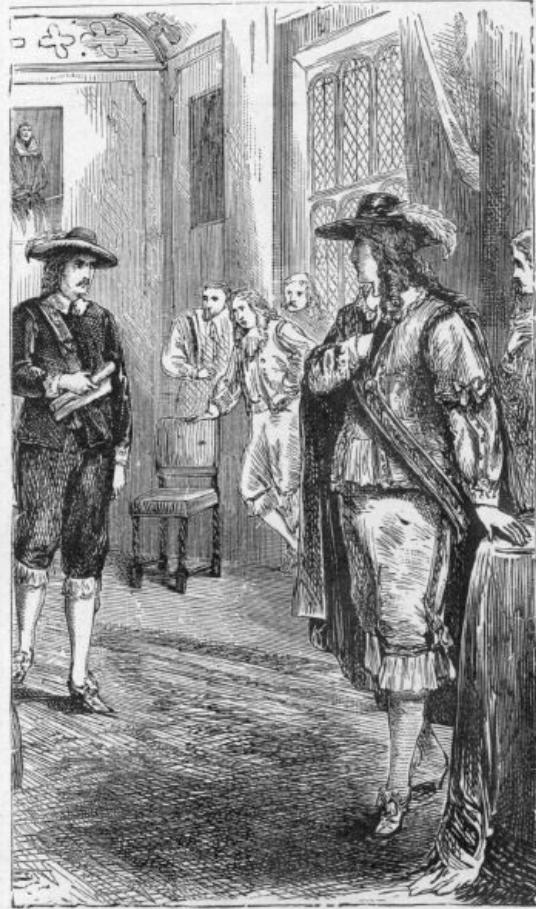
"I have come at thy desire."