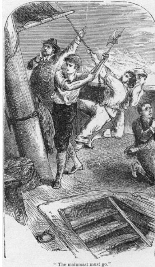
"The mainmast must go."

Scarcely were the men off the yards, when the wind, as if suddenly let loose, struck the ship with terrific fury,