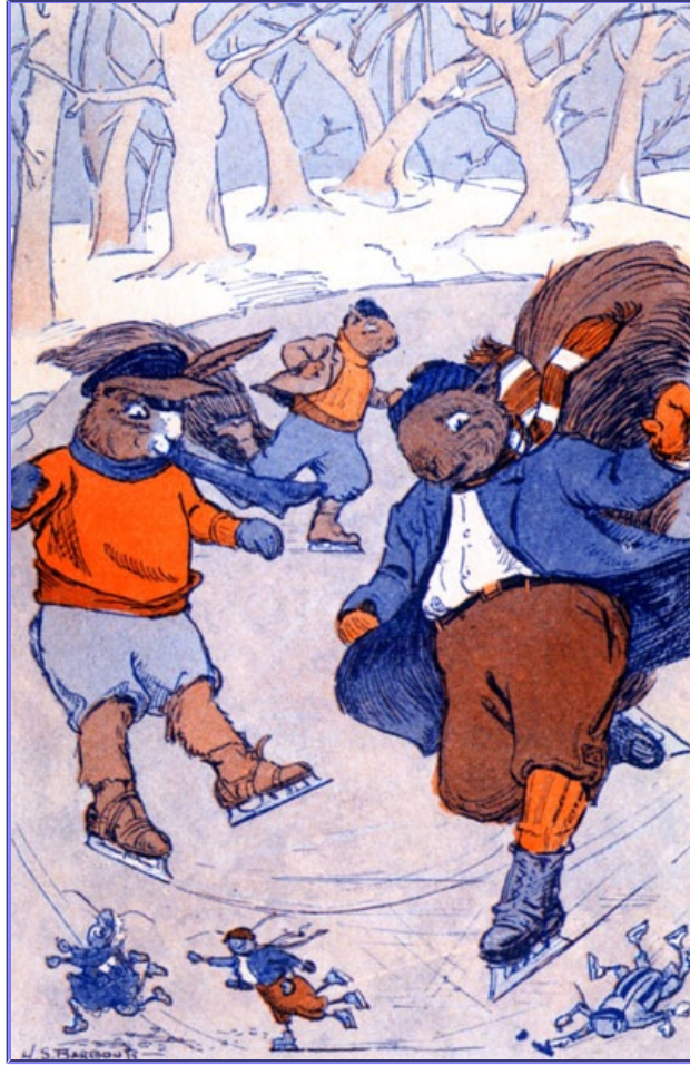
Little Jack and The Squirrel Brothers Skated Merrily