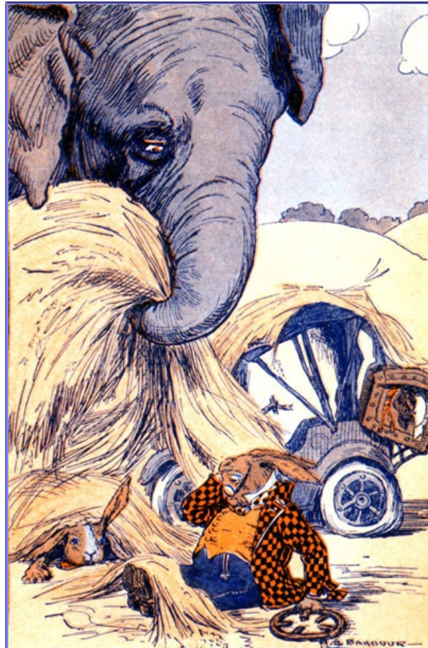
The Elephant Put the Hay Right Back on the Wagon.

Well, sir! He wound his trunk around that pile of hay and put it back on the wagon. Then he dropped in his pocket the nickel the farmer gave him, but he wouldn't take the carrot cent that grateful Uncle John offered him.